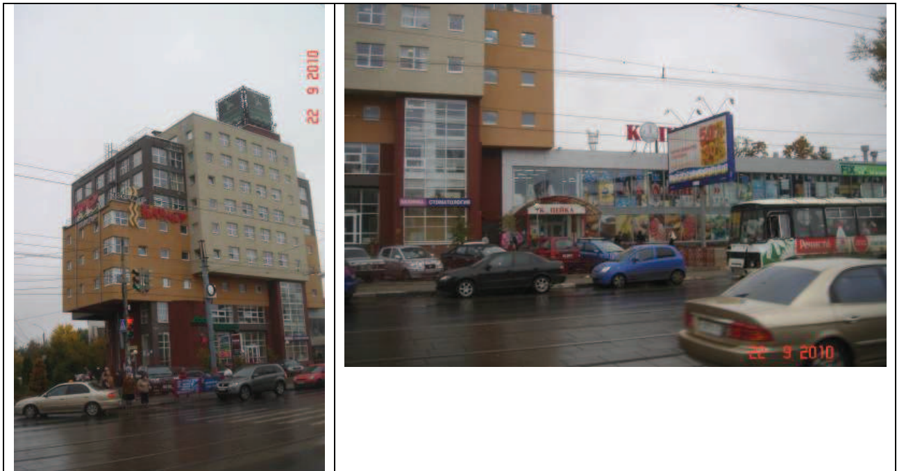
Figure 1. Some photographs showing the Teledom building and its environment

Case 1: The Teledom building (see Figure 1). This is a multilevel office building with an underground parking and includes a large number of units with various types of registered rights. One part overhangs the road and another part is located above other building located on a neighbouring parcel. Only the basement is represented within the land parcel on a 2D map.