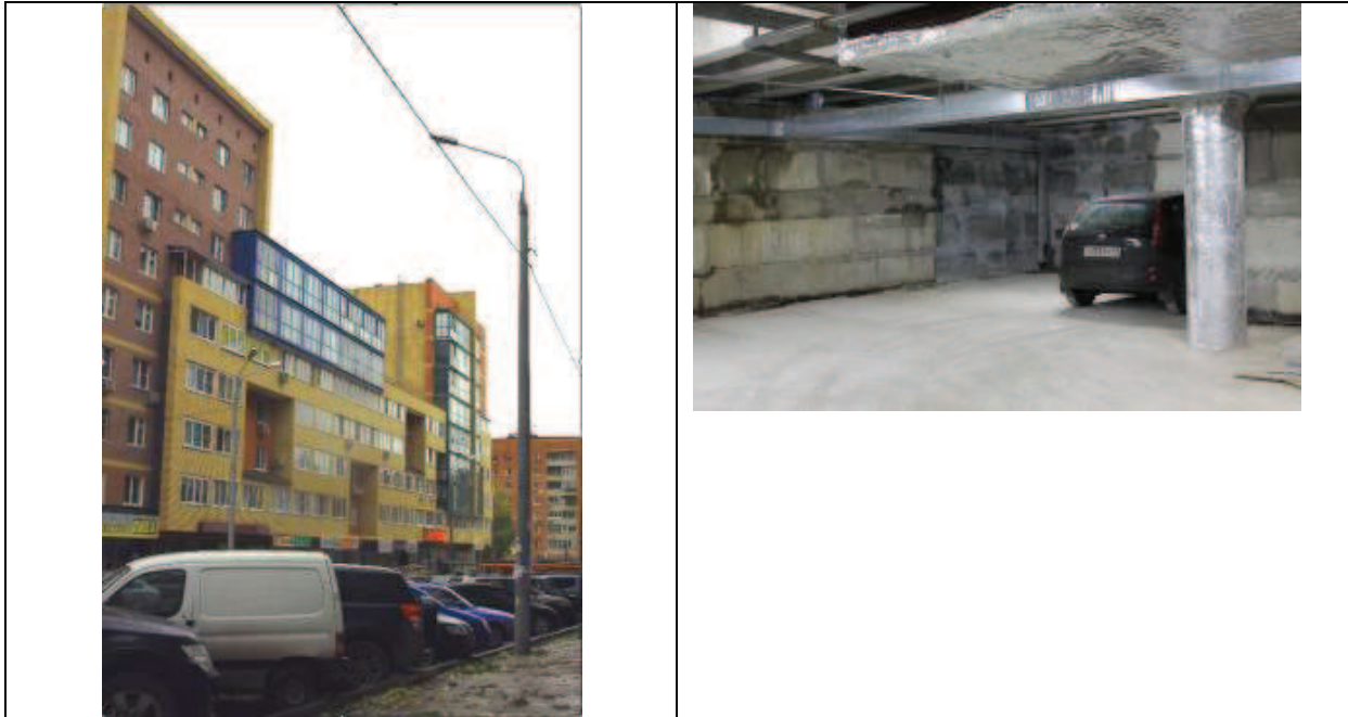
Figure 2. Some photographs showing the apartment complex with its underground parking