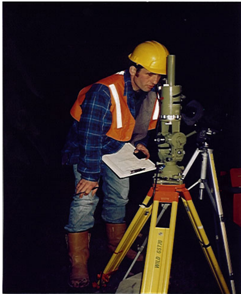
Fig. 1 Gyrotheodolite observations with video camera

Observations of time at scale divisions are captured on videotape. The time was recorded when the moving mark crossed a scale division. In the laboratory, Fig. 2 a time code was put on the videotape to extract each time observation. With the aid of video frames, the quality of timing improved from approximately 0.2 seconds, at best by manual methods, Gregerson (1974) to the time equivalent of one frame. One frame = 1/25 seconds = 0.04 seconds. Automated data capture leads to a great increase in the quantity and quality of observations. A new mathematical model eq. (1) was derived. This model takes into account the changes in the physical environment of the suspended gyroscope, that is, to account for accelerations.