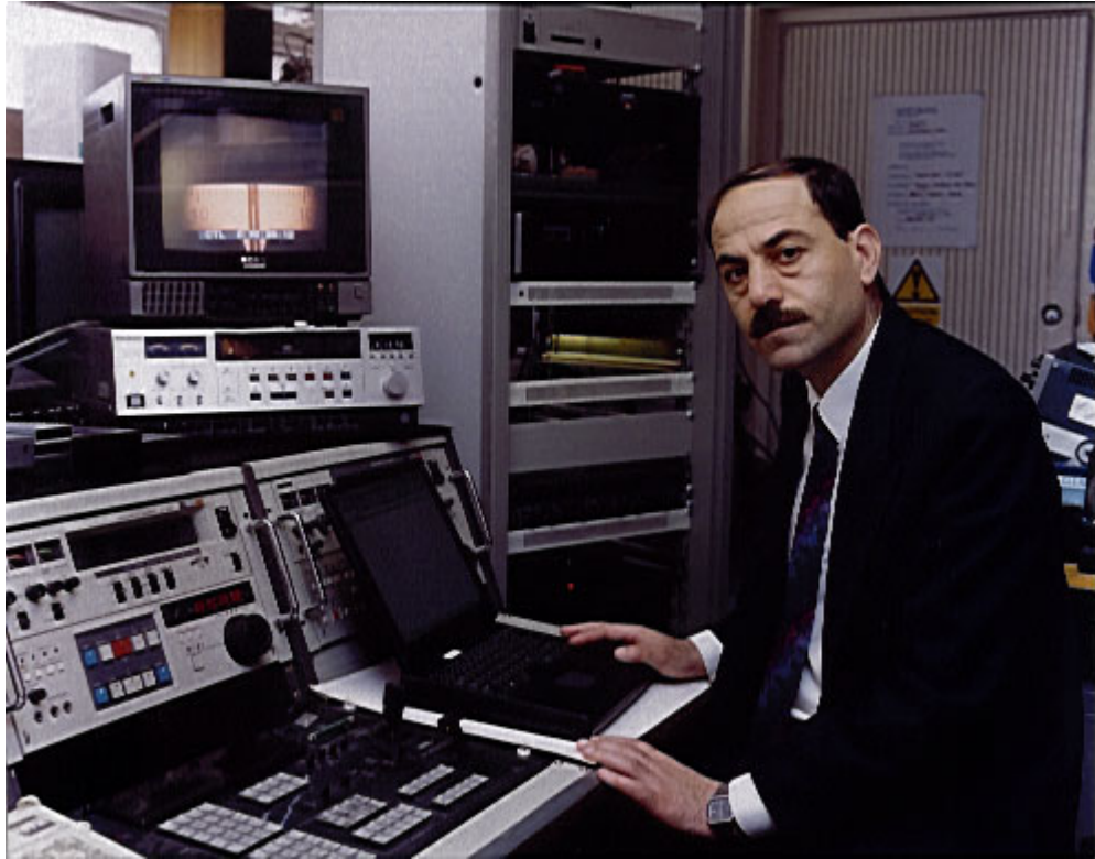
Fig. 2 Laboratory data processing

Video imagery using frame analysis is selected and the time data is extracted with the aid of a microcomputer, “laptop”, see Fig. 2. After processing the time data, it is used in a rigorous mathematical model and processed by least square techniques, which lead to high quality solutions and statistical assessments.