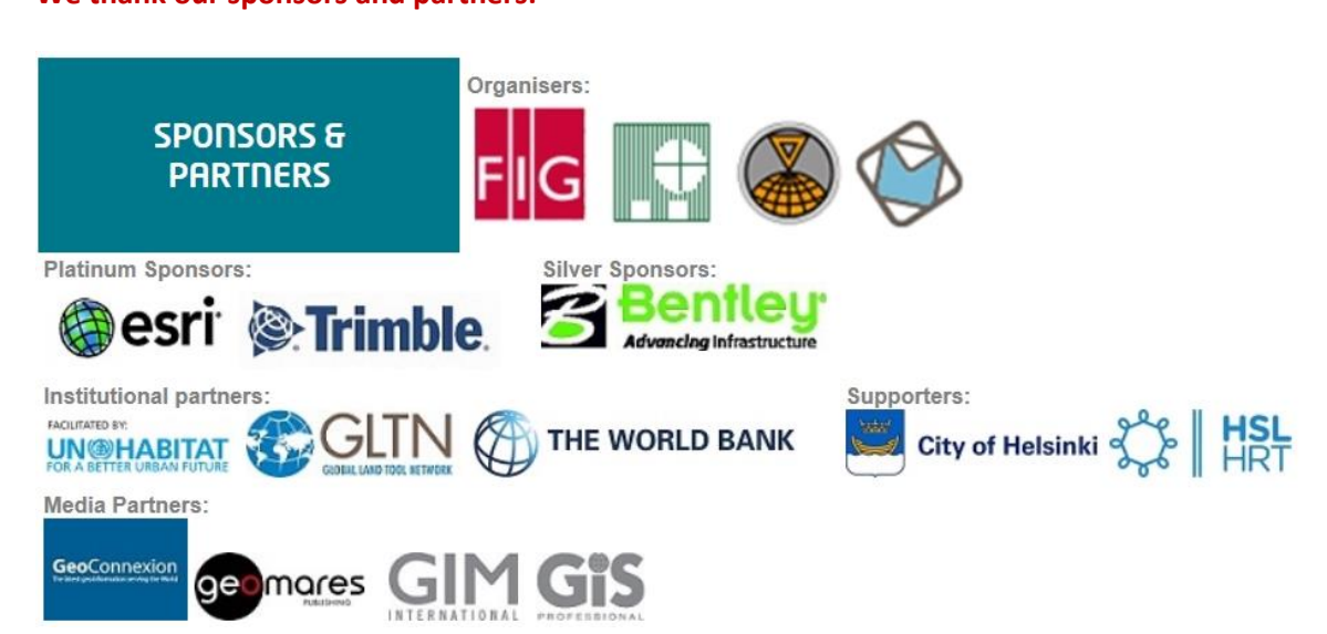
FIG Newsletter April 2017 3/7