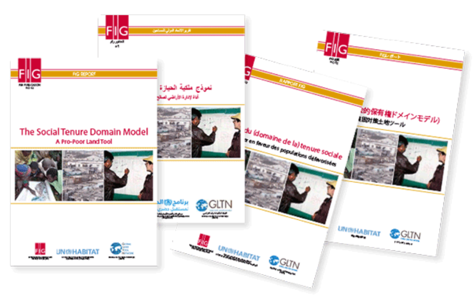
FIG Publication on STDM now available in 4 languages - English, French, Arabic and Japanese

http://www.fig.net/news/news_2017/04_pub52_4languages.asp