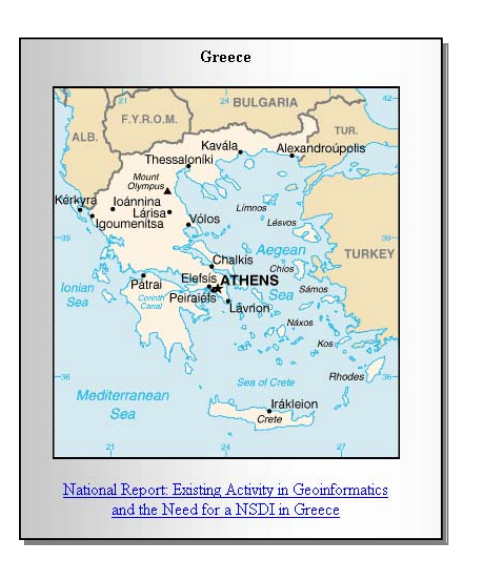
Fig.4: Map & NSDI of Greece