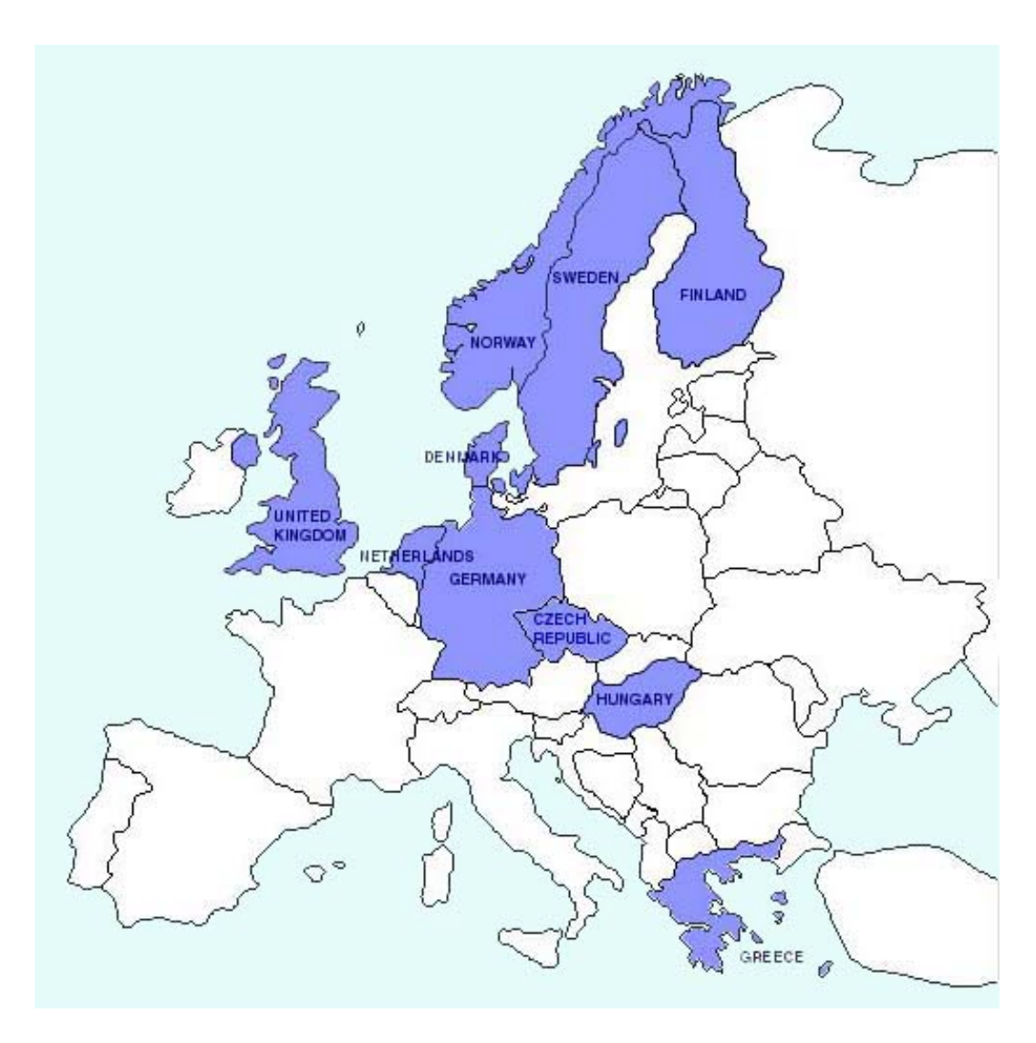
Fig.6: Map of Europe showing the coverage achieved so far with collected National reports