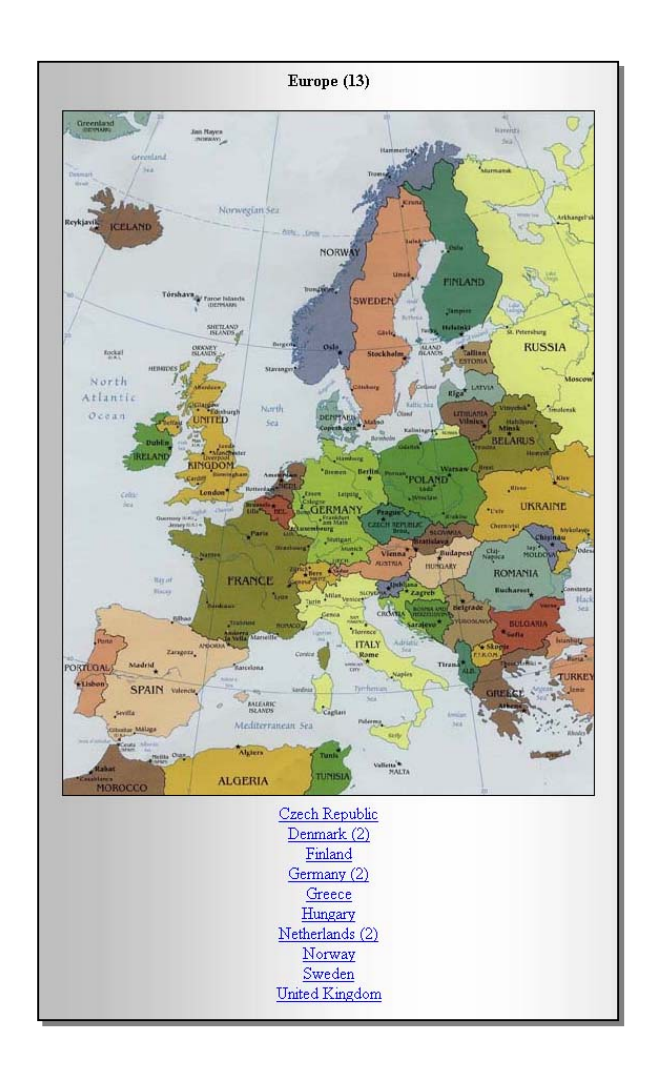
Fig.3: Map of Europe