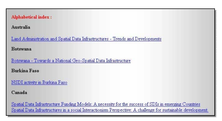
Fig.1: Alphabetical index of the National Reports

The first new component of the recently upgraded WG3.3 Web Inventory, is the NSDI archive section. The National Reports used to be alphabetically indexed according to the corresponding country and the user should browse the index to reach the NSDI report of his/her interest (Fig.1).