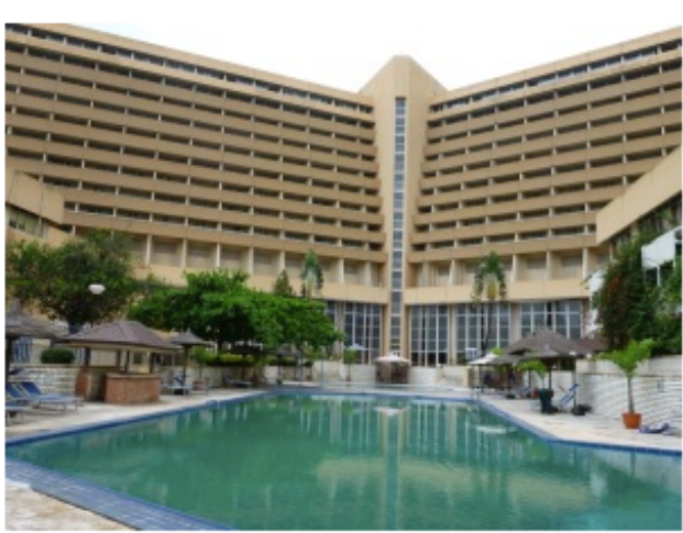
Nicon Luxury Hotel pool area and hotel