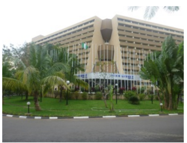
Nicon Luxury Hotel seen from the front