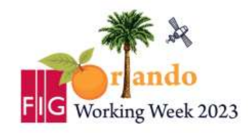
FIG WORKING WEEK 2023

28 May - 1 June 2023 Orlando Florida USA