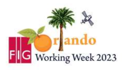
FIG WORKING WEEK 2023

28 May - 1 June 2023 Orlando Florida USA