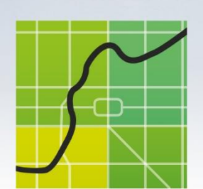
FIG Working Week 2016