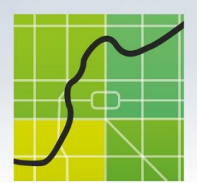
FIG Working Week 2016