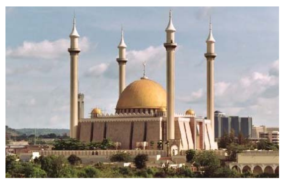
Nigerian National Mosque

The crescent shape of the city reflects the infrastructural considerations and the topography of the site. Abuja is located at 9°10′N 7°10′E. Most countries moved their embassies to Abuja and maintain their former embassies as consulates in the commercial capital of Nigeria, Lagos. Abuja's feature is Aso Rock, a 400-metre monolith left by water erosion. The Presidential Complex, National Assembly complex, Supreme Court, hotels, museums, international conference center, good roads. "Aso" means "victorious" in the language of the (now displaced) Asokoro ("the people of victory"). Other sights include the Nigerian National Mosque and the National Ecumenical Centre cathedral. The city is served by the Nnamdi Azikiwe International Airport, while Zuma Rock lies nearby.