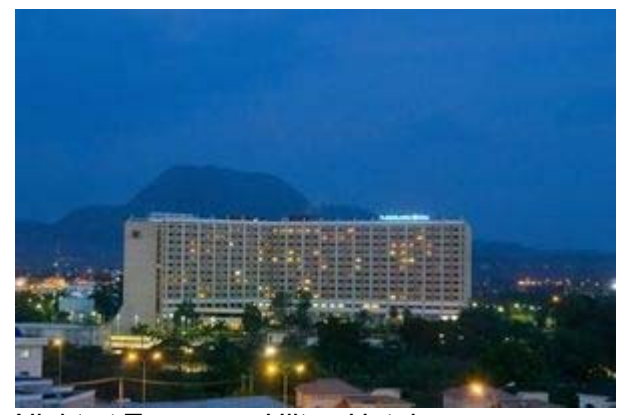
Night at Transcorp Hilton Hotel