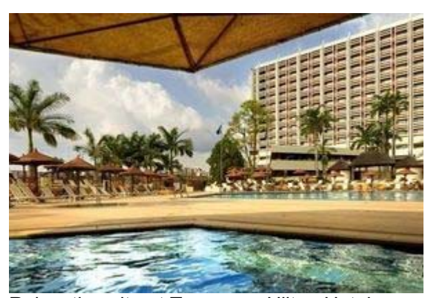
Relaxation site at Transcorp Hilton Hotel

Hotel services include e.g.: recreational facilities, business centre, Club Lounge and 2 Executive floors, Conference/Meeting/Exhibition and Banqueting facilities, Medical Clinic and Dentist, Free Parking, Internet facilities, Simultaneous translation, Handy craft Village, Minizoo and Casino.