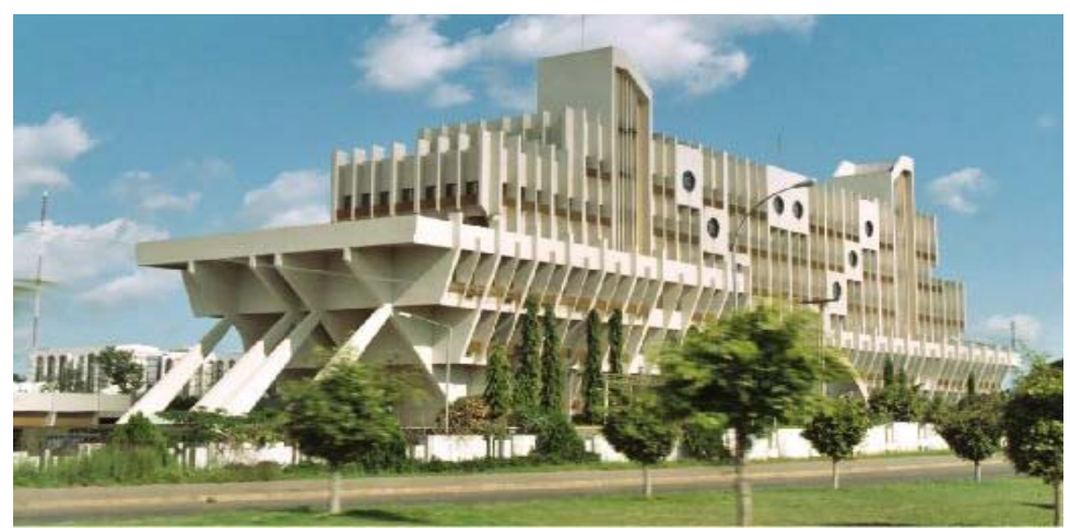
National Defence Headquarters