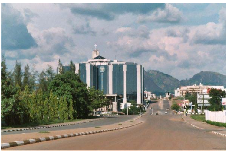
CENTRAL BANK OF NIGERIA

The city has been well planned and the Central District is located between the foot of Aso Rock and the Three Arms Zone to the southern base of the ring road. It is like the city's spinal cord, dividing it into the northern sector with Maitama and Wuse, and the southern sector with Garki and Asokoro. While each district has its own clearly demarcated commercial and residential areas, the Central District is the city's principal Business Zone, where practically all parastatals and multinational corporations have their offices located. An attractive area in the Central District is the region known as the Three Arms Zone, so called because it houses the administrative offices of the executive, legislative and judicial arms of the Federal Government. A few of the other sites worth seeing in the area are the Federal Secretariats alongside Shehu Shagari way, Aso Hill, the Abuja Plant Nursery, the Parade Square and the Tomb of the Unknown Soldier. The Brigade of Guards organizes a twenty-four hour watch at the spot and they have a colorful ceremonial change of guard. The National Mosque and National Ecumenical Church are located opposite each other on Independence Avenue.