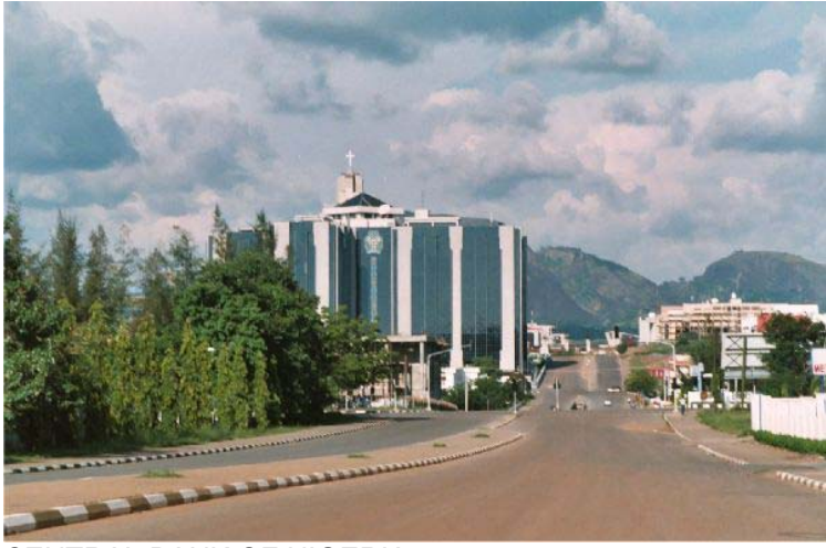
CENTRAL BANK OF NIGERIA

The city has been well planned and the Central District is located between the foot of Aso Rock and the Three Arms Zone to the southern base of the ring road. It is like the city's spinal cord, dividing it into the northern sector with Maitama and Wuse, and the southern sector with Garki and Asokoro. While each district has its own clearly demarcated commercial and residential areas, the Central District is the city's principal Business Zone, where practically all parastatals and multinational corporations have their offices located. An attractive area in the Central District is the region known as the Three Arms Zone, so called because it houses the administrative offices of the executive, legislative and judicial arms of the Federal Government. A few of the other sites worth seeing in the area are the Federal Secretariats alongside Shehu Shagari way, Aso Hill, the Abuja Plant Nursery, the Parade Square and the Tomb of the Unknown Soldier. The Brigade of Guards organizes a twentyfour hour watch at the spot and they have a colorful ceremonial change of guard. The National Mosque and National Ecumenical Church are located opposite each other on Independence Avenue.