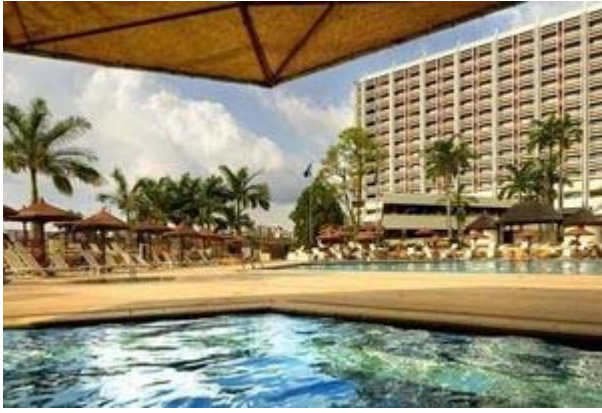
Relaxation site at Transcorp Hilton Hotel

Hotel services include e.g.: recreational facilities, business centre, Club Lounge and 2 Executive floors, Conference/Meeting/Exhibition and Banqueting facilities, Medical Clinic and Dentist, Free Parking, Internet facilities, Simultaneous translation, Handy craft Village, Minizoo and Casino.