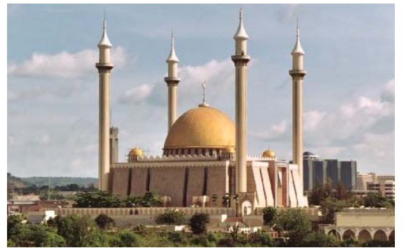
Nigerian National Mosque

The crescent shape of the city reflects the infrastructural considerations and the topography of the site. Abuja is located at 9°10′N 7°10′E. Most countries moved their embassies to Abuja and maintain their former embassies as consulates in the commercial capital of Nigeria, Lagos. Abuja's feature is Aso Rock, a 400-metre monolith left by water erosion. The Presidential Complex, National Assembly complex, Supreme Court, hotels, museums, international conference center, good roads. "Aso" means "victorious" in the language of the (now displaced) Asokoro ("the people of victory"). Other sights include the Nigerian National Mosque and the National Ecumenical Centre cathedral. The city is served by the Nnamdi Azikiwe International Airport, while Zuma Rock lies nearby.