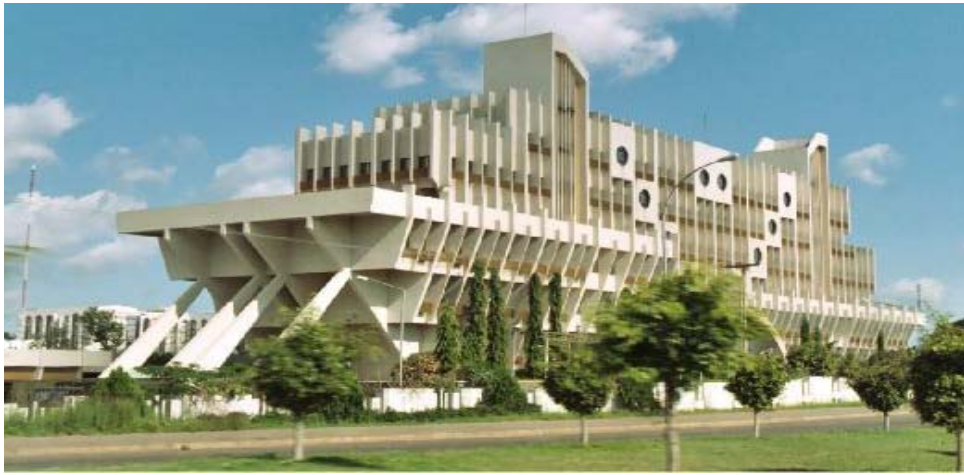
National Defence Headquarters