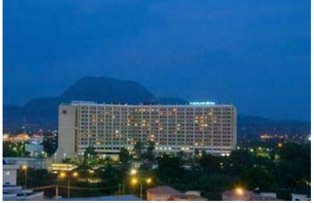
Night at Transcorp Hilton Hotel