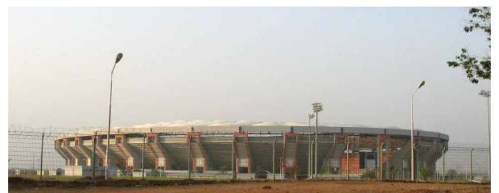
National Stadium, Abuja