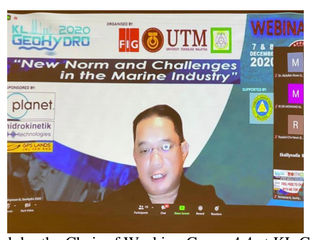
Figure 2: Speech by the Chair of Working Group 4.4 at KL GeoHydro 2020