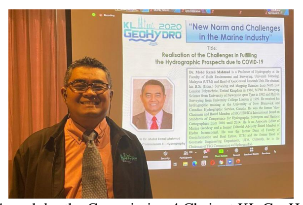
Figure 1: Speech by the Commission 4 Chair at KL GeoHydro 2020,

FIG Commission 4, The Association of Authorised Land Surveyors Malaysia (PEJUTA) and Universiti Teknologi Malaysia (UTM) organised the KL GeoHydro 2020 Conference on 7-8 December 2020. The event was held via online platform. The Commission 4 Chair and the Chair of Working Group 4.4 attended and presented in the Conference.