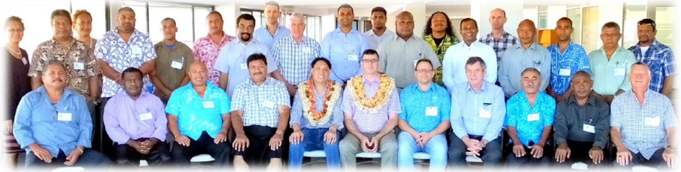
PGSC 2014 - Photo courtesy of SPC