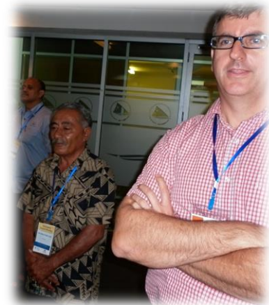
PGSC members work shopping the strategic plan

Responses from the PGSC members were then analysed and grouped which resulted in the following preliminary strategic goals being endorsed by the PGSC –