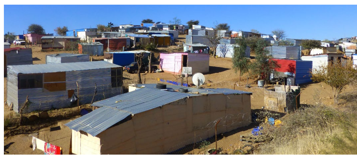
Informal settlement, Windhoek, Namibia