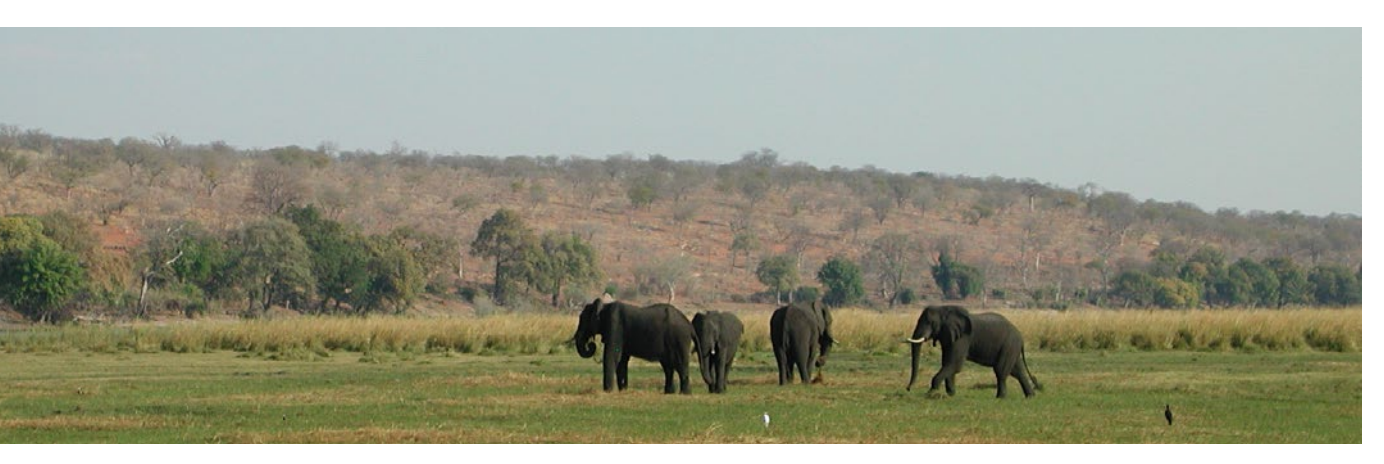
Kasane river delta, Botswana