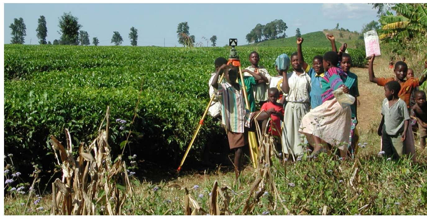
Surveying the future, Malawi