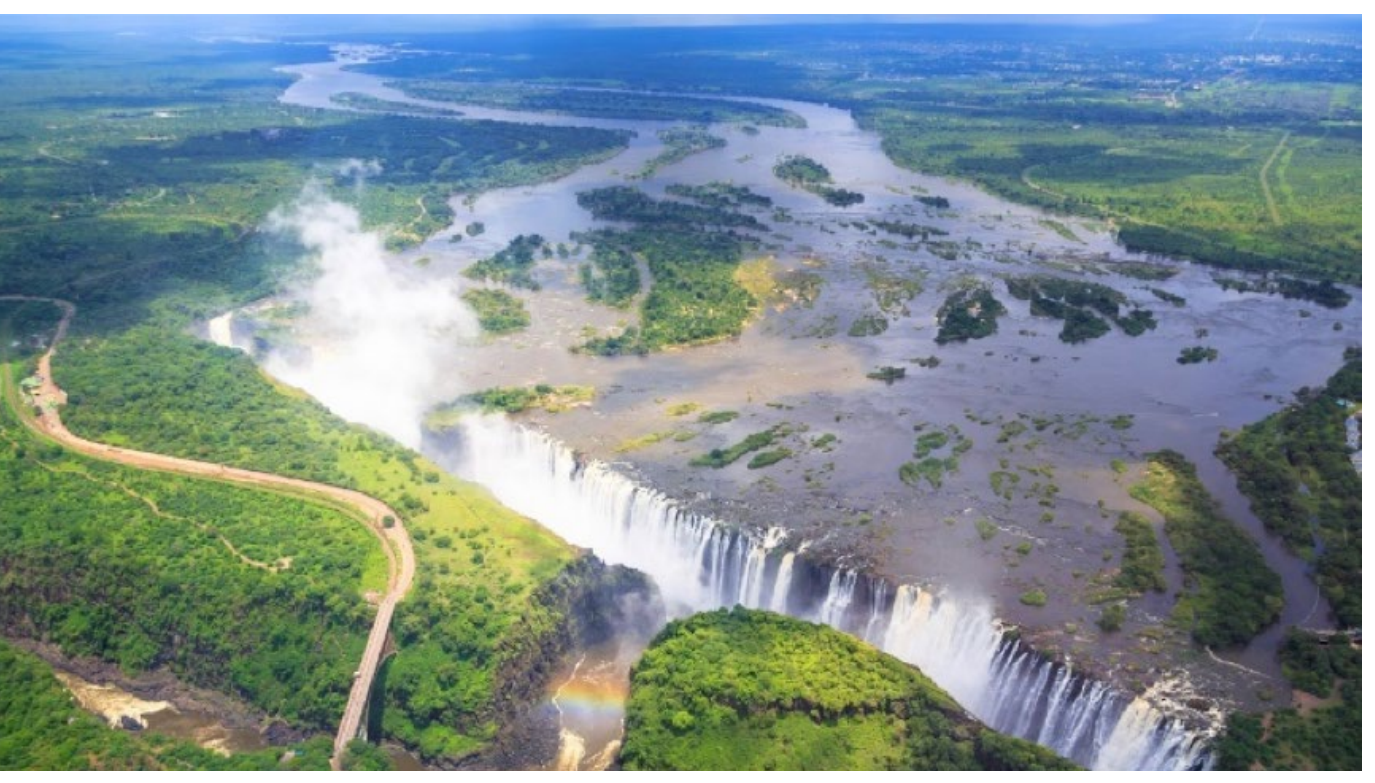
Victoria Falls represent a kind of meeting point of many Southern Africa Countries including Zimbabwe, Zambia, Botswana, Namibia and Angola