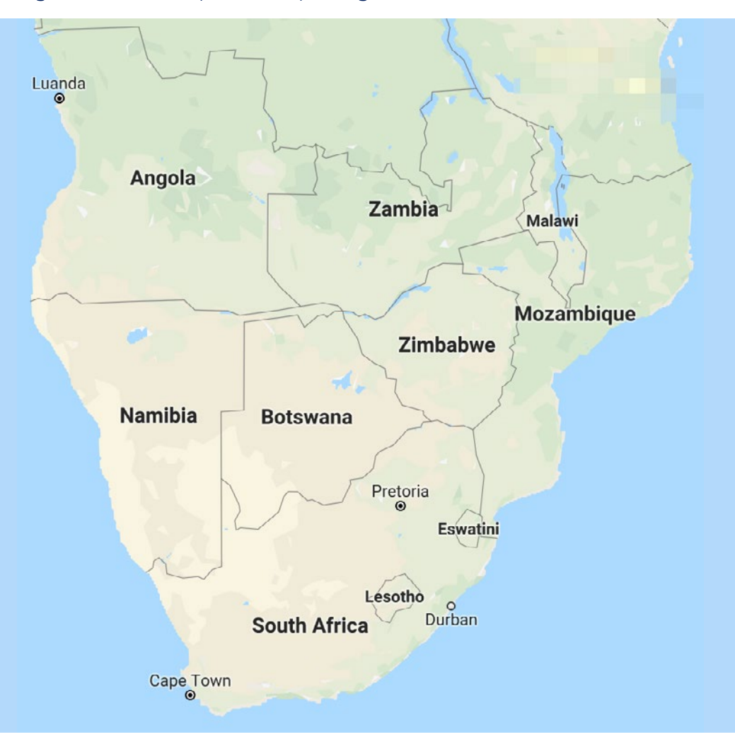
The Southern Africa Region.

This project on "Land Governance in Southern Africa" covers a description and assessment of Land Governance in the Southern Africa Region (Africa mainland south of Tanzania and the Democratic Republic of Congo). The project covers ten countries: Angola, Botswana, Lesotho, Malawi, Mozambique, Namibia, South Africa, Eswatini, Zambia and Zimbabwe. Eight countries are completed while Angola and Mozambique are still pending.