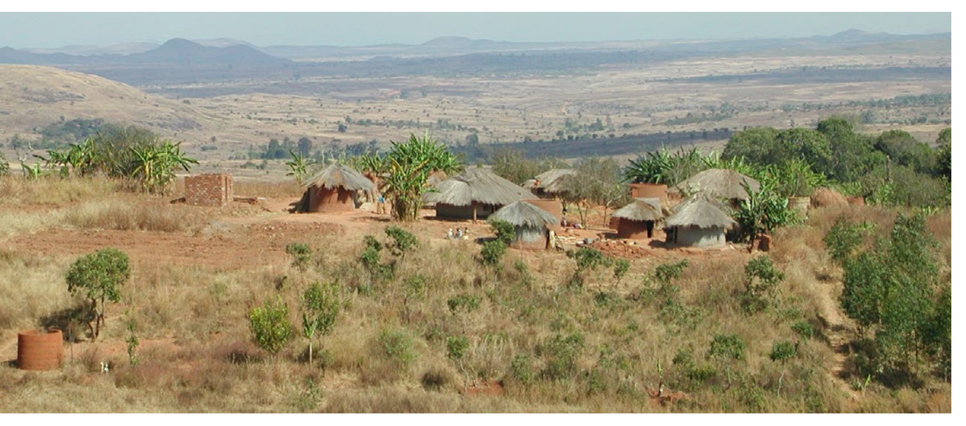
Customary tenure area, Mozambique

Land administration is technically complex and cuts across many disciplines, such as law; information technology; geodesy; geomatics and surveying; economics; urban planning; anthropology; and environmental, social, and political sciences. Some of these fields are rapidly advancing, making it important not to remain with outdated solutions but rather to design systems in a way that anticipates future improvements. A key challenge is also to make trade-offs that help improve overall system performance rather than focus on over- engineered approaches that may be appropriate from a disciplinary perspective but weigh down the system and eventually make it unsustainable. While these tradeoffs are ultimately a policy decision, a framework for the land sector can help to identify key areas of concern and guide support for developing an integrated strategy. (World Bank, 2012, 20)