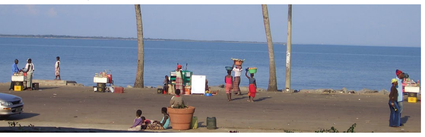
Beach market, Maputo, Mozambique