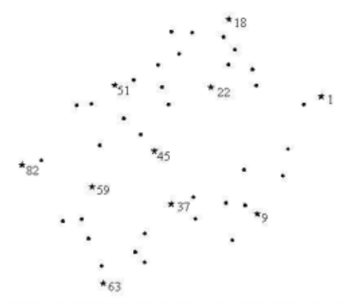
Chart 2: Distribution of benchmarks in the D-order GPS network

points No.13 No.27 No.46 and No.77. Removing the 4 points, the new method is tested with the rest 40 points.