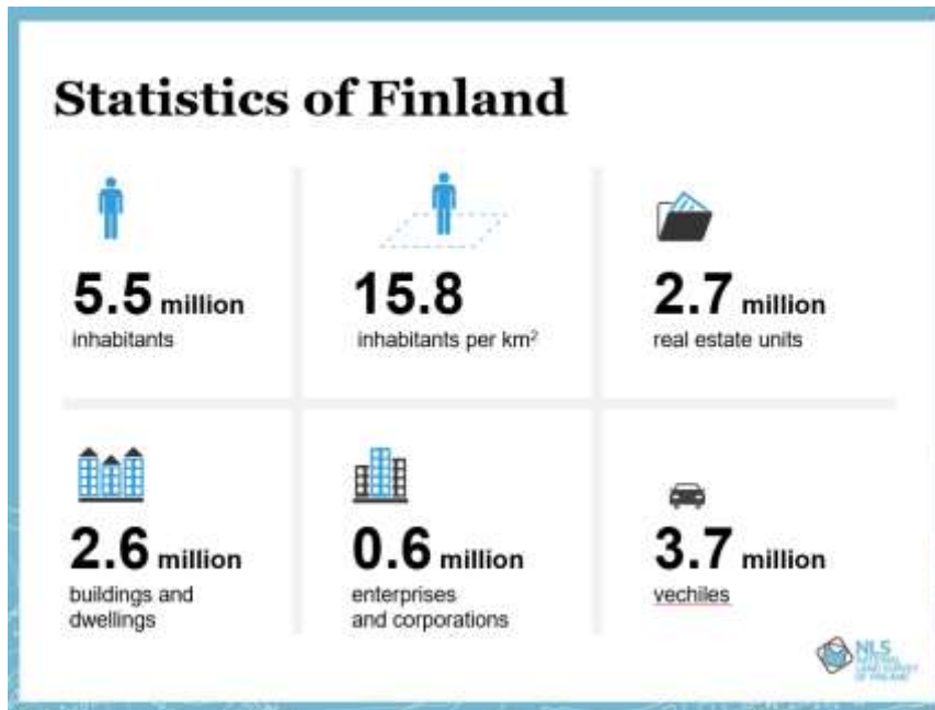
Figure 2. Statistics about Finland

mortgage issues a case exceeds the competence level of a surveyor, they must assign it to a specialist or legal counsel for further processing. It is estimated that roughly 95% of all registrations are normal cases that do not need to be reassigned.