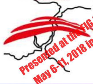
FIG 2018 ISTANBUL

Presented at the FIG Congress 2018, May 6-11, 2018 in Istanbul, Turkey