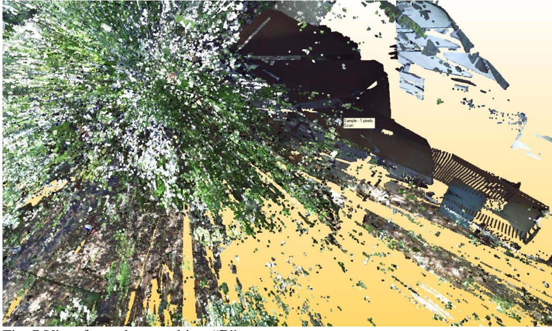
Fig. 7 View from above - object "B"

The graphical examples, given in figures NN 5, 6 and 7 show the difficult situation on the terrain, which existed during the performing of the geodetic measurements. The application of 3D terrestrial laser scanning made possible the measurements for these objects in the hard terrain conditions around them, because of the availability of enormous amount of precisely measured spatial information and photo realistic data.