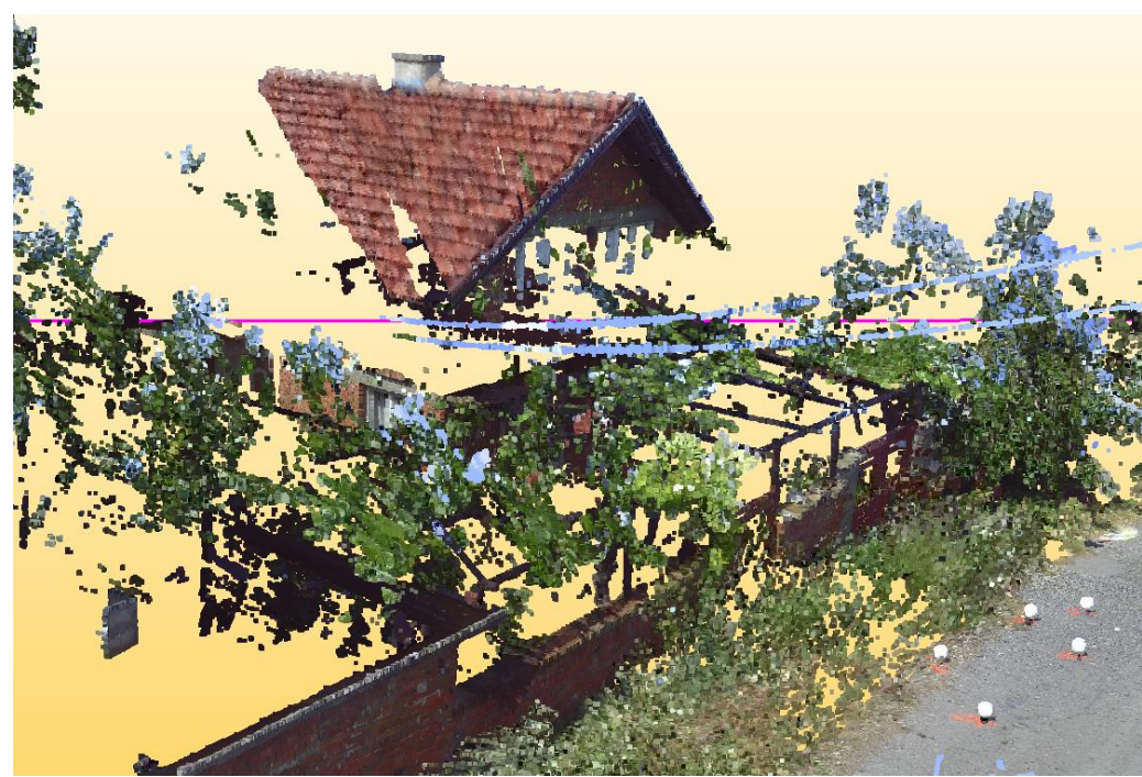
Fig. 5 Contactless measurements for impossible to access object "A"

The edges of the building were acquired by the laser scanner using two positions of the scanner, as shown on fig. 6. It should be noted, that the direct access to the object was not safe and not possible due to the existence of tall green plants.