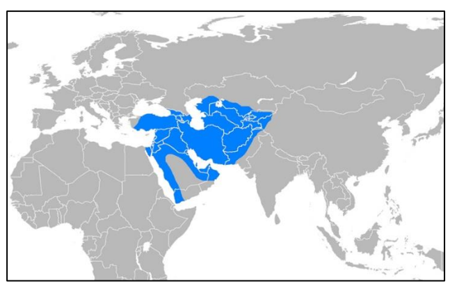
Map 2: Great Seljuk Empire Map

After the Malazgirt victory won on August 26, 1071, Sultan Alparslan demanded the conquest of all Anatolia by ordering execution of the treaty to the commander because the treaty was not obeyed by the Byzantine emperor Diogenes. The Turkmen tribes under the order of Seljuk were sent west from Central Asia to the Byzantine border in Eastern Anatolia. Byzantine fortresses and garrisons, which could not resist the raids of the Seljuks, were passed by the Turks. The Turkish influxes extended to the Sea of Marmara and the conquered Anatolia was settled. All necessary measures were taken for the Turkification and Islamization of Anatolia.