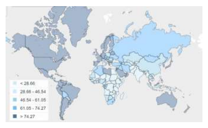
Figure 1: Urban Population (% of total) (World Bank 2018)

The population living in the city is increasing around the world. According to the United Nations, 66% of the world's population will live in urban areas by 2050 (United Nations, 2015). Nowadays all countries have people living in the urban areas (Figure 1). The human have some basic needs such as food, housing etc. but modern people who live in urban area have a lot of needs such as clean food, clean water, energy, transport, communication, comfortable residential area and other common services like security, education, health etc. The governments have to provide all needs of the citizens which mentioned above.