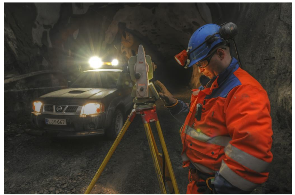
Figure 2. Surveying underground in Kittilä mine (Agnico Eagle 2018b).

Mine surveyors use quite conventional surveying practices, but their working environment is very different from other land surveying (figure 2). It is more demanding to work in busy mine than under peaceful open sky. Mine is a constantly changing working environment. A place that was safety previously can be dangerous next time. Air humidity, dust and gases, even dangerous gases like carbon monoxide (CO), create problems for workers, instruments and machines. Traffic is also a major challenge in mines. Mine surveyors have to be creative with traffic related problems when they plan and perform their measurements. (Alatalo 2017.)