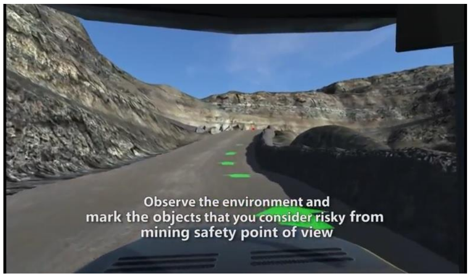
Figure 3. Hazard inspection scenario implemented in the virtual model of existing open pit mine in Siilinjärvi. (KaiVi 2016.)

Lapland and Kajaani universities of applied sciences have worked together to develop engineer education in the mining sector for many years. The cooperation has confirmed their role as key providers of engineer education on bachelor level in Eastern and Northern Finland. There have been several development projects. One of the projects has been a virtual learning environment for mining (KaiVi). It is a simulation based, game-like learning environment. It allows for the visualization of the activities and decision-making with cause-effect relationships in mines that are difficult or impossible to do without a virtual environment. The training environment can be utilized in various fields of education, such as infrastructure, maintenance, mechanical engineering, construction engineering, electrical engineering, and automation. The students will learn to work together in a multidisciplinary mining environment. This will improve their readiness to work in mines safely. (Figure 3.)