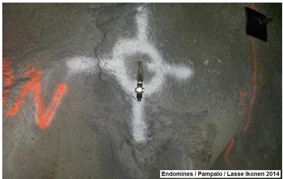
Figure 4. Wall control point in Endomines' Pampalo mine (Ikonen 2014).

For example, in Kittilä mine, the control network is extensive. There is a sparse primary control network on the ground, which dates back to 1980's. The primary points defines the reference frame to be the old Finnish national frame, which is not used anymore. The control network continues from the ground through the entrance tunnel and advances along the tunnels to everywhere in then mine, so that there are about 1500 secondary points located on the walls of the tunnels at about 100 m intervals (figure 4). In addition there are approximately the same number of auxiliary points for short term use. Because of the tunnel network expands and mining operations and traffic destroys control points, mine surveyors have to do control surveys continuously. (Alatalo 2017.)