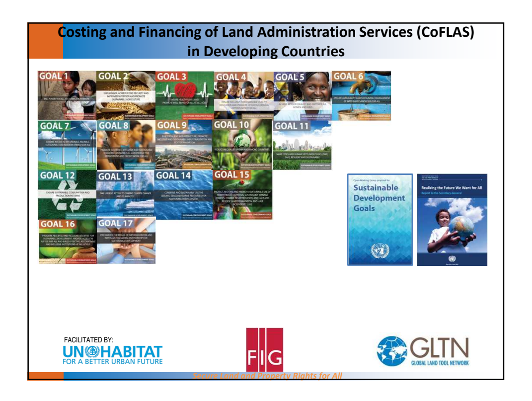
FIG Working Week 2015