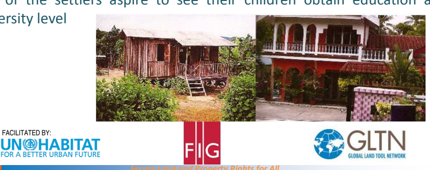
FIG Working Week 2015