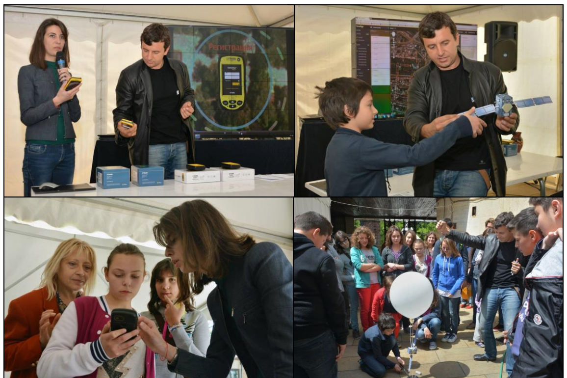
Figure 3. A total of six Trimble Juno SD and 3D mobile GNSS devices were used in 3G internet mode to connect in real-time to the cloud-based Trimble TerraFlex solution. A paper model of a Galileo satellite was hidden in the park - two competing groups of children had to perform tasks to find it. Once found, it was launched on a helium rocket in the sky.

The 15 minute presentation introduced GNSS technologies in a simple, intelligible and impressive way. GNSS basics, purposes and applications were explained in terms of the European Galileo system. The topic got the audience personally engaged in the story of the Galileo satellite given the name of their compatriot, the young Bulgarian girl Natalia Ruseva.