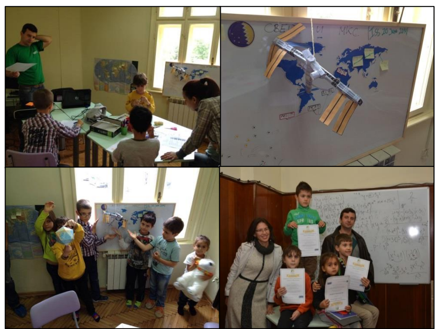
Figure 8. The ISS educational game, awarded in the monthly ESA Kids space competition

The European Space Agency (ESA) provides a highly interactive web portal for children – ESA Kids. It hosts a monthly competition on various space topics. In June 2014 the topic was the International Space Station (ISS). Children everywhere are encouraged to perform activities, games, models, drawings or whatever they can come up with, focused on the topic. Our team developed an educational game, consisting of paper model of ISS, combined with real-time tracking of its orbital location. A web-based tracker was used. On every 15 minutes the ISS location was pinned on a global map. Photos from the game were sent to the ESA Kids competition and finished as a runner up. The children were awarded from ESA with school accessories and certificate.