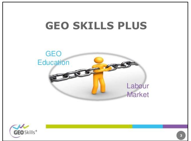
Figure 1. GeoSkills+ philosophy