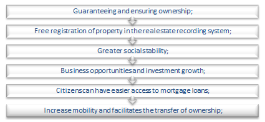
Figure 4 – Major Achievements of the Systematic Registration

According to Enemark, 2012, the international development in the area of Cadastre and Land Administration has been remarkable with FIG taking a leading role because throughout the last 10-15 years a number of initiatives have been taken with a focus to explain the importance of land administration systems as a basis for achieving economic, social and environmental sustainability. The main international organizations such as UN, FAO, HABITAT and especially the World Bank have been key partners in this process. In Figure 4 are emphasized the major achievements of the systematic national registration.