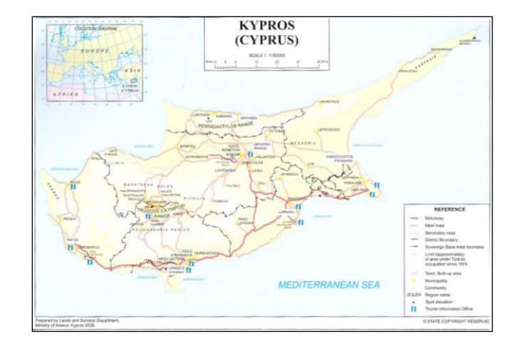
Map 1: A geographical map of Cyprus

Cyprus' population at the end of 1995 was 735.000. Population distribution by ethnic group was 84,7% Greek Cypriots, 12,3% Turkish Cypriots, and 3% foreigners residing in Cyprus. The Capital of the island is Nicosia and its major towns are Limassol, Larnaca, Paphos, Famagusta, Kyrenia and Morphou.