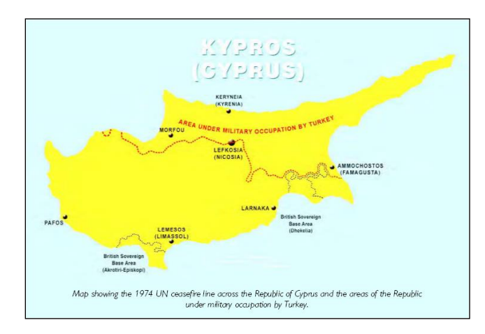
Map 2: Administrative map of Cyprus

Agreement. In addition, since the invasion there is a systematic destruction and alteration of the historic and cultural character of the part of Cyprus under Turkish occupation.