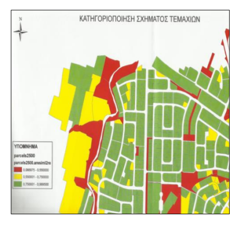
Maps 3 & 4: Categorization by road access and shape