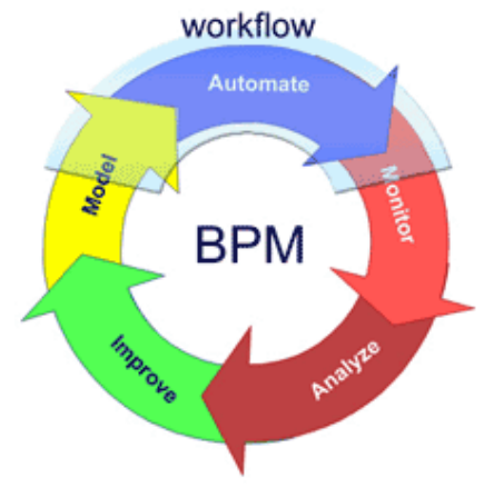
Figure 2: Relation between BPM and WFM

Reference model of a WFMS as defined by Workflow Management Coalition (WFMC) is shown below (Figure 3).