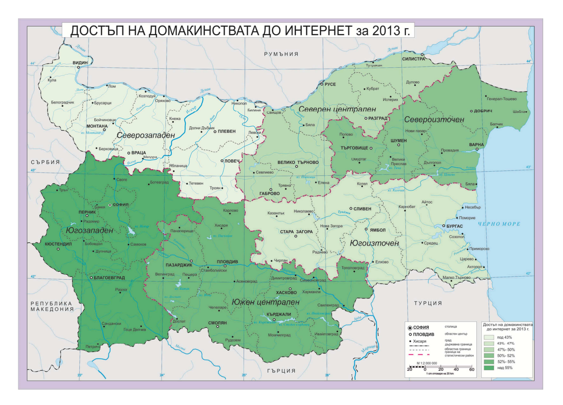
Figure 7. A map presenting household access to the Internet for 2013