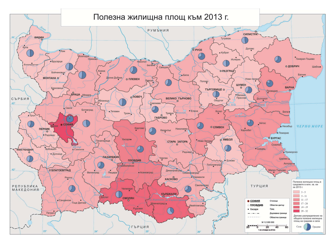
Figure 4. Map of useful living area for 2013.

is the useful living area of the housing fund. Map of the housing fund - useful living area - for the year 2013 is shown in figure 4. The map representing useful living area for 2013 (figure 4) shows larger proportion to the cities – the largest one is in Sofia (29-32 mln m<sup>2</sup>), followed by Smolyan, Kardzhali (24-29 mln m<sup>2</sup>), Plovdiv (17-24 mln m<sup>2</sup>), Sliven, Varna and Burgas (11-17 mln m<sup>2</sup>). Again one can see that the largest useful living area of the housing fund is documented logically in the capital as well as in Plovdiv – both cities fall in the zones of most severe seismic hazard in Bulgaria.