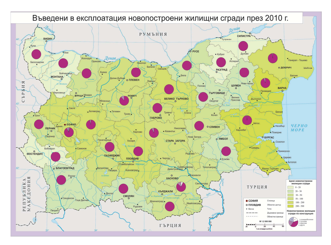
Figure 2. Map of newly built housing constructions for 2010.