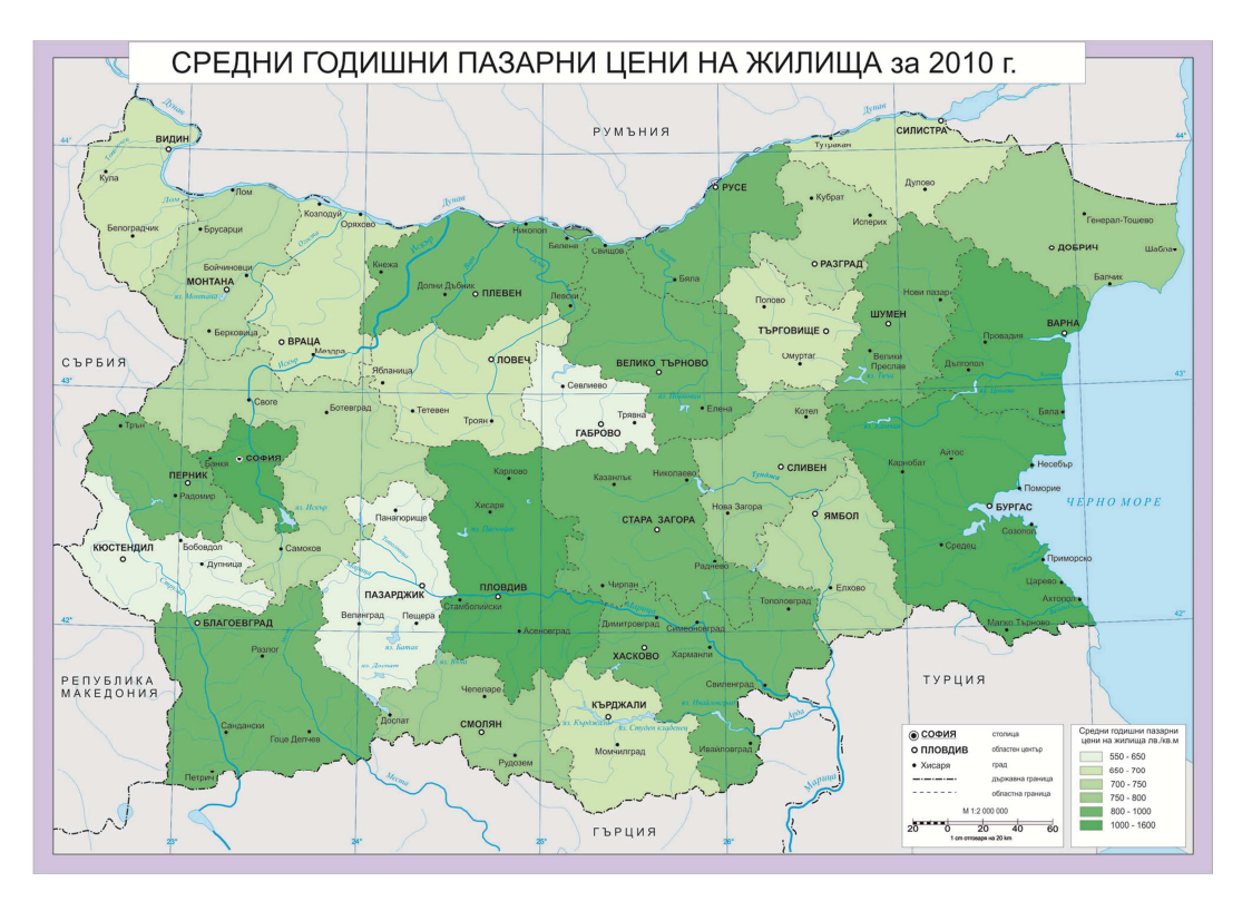
Figure 6. Map of average annual prices for housing for 2010

order to avoid errors. With BD, we are turning back to the expert who is invoked to propose next generation technology solutions, combining multidisciplinary approaches (Bandrova et al, 2014).