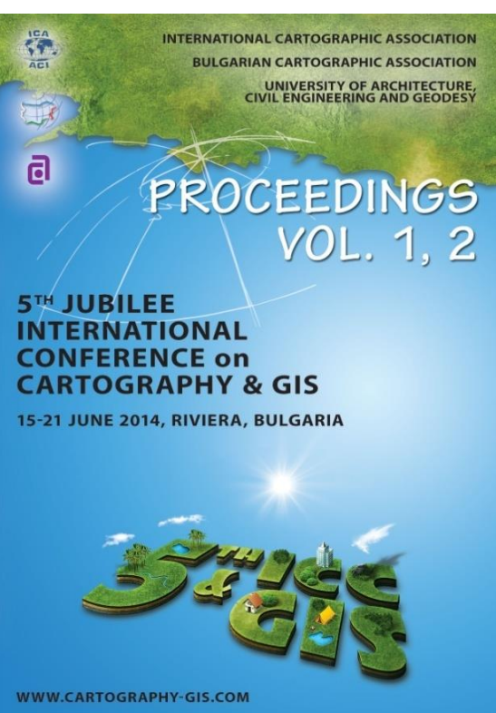
Fig. 5. Book and Proceeding from 5<sup>th</sup> ICC&GIS (BandrovaT. et al., 2014)