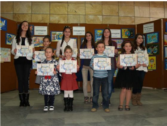
Fig.7. Poster and awarded children, participated in Barbara Petchenic Competition, 2015