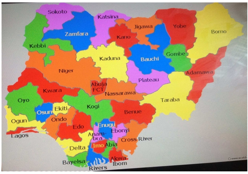
MAP OF NIGERIA SHOWING THE STATES