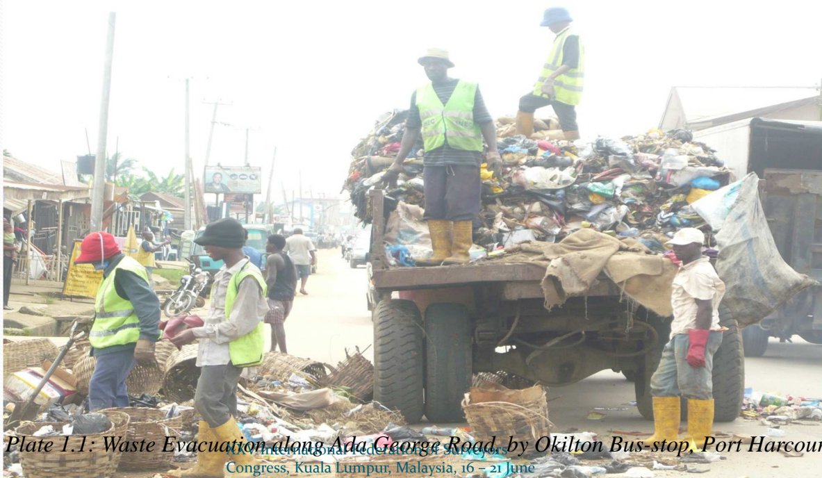
Plate 1.1: Waste Evacuation along Ada George Road, by Okilton Bus-stop, Port Harcourt.

MSW Management was assigned to Local Contractors. The block waste collection system was adopted and open Vehicles used for haulage.