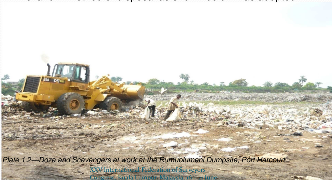
Plate 1.2—Doza and Scavengers at work at the Rumuolumeni Dumpsite, Port Harcourt.

XXV International Federation of Surveyors Congress, Kuala Lumpur, Malaysia, 16 – 21 June 2014