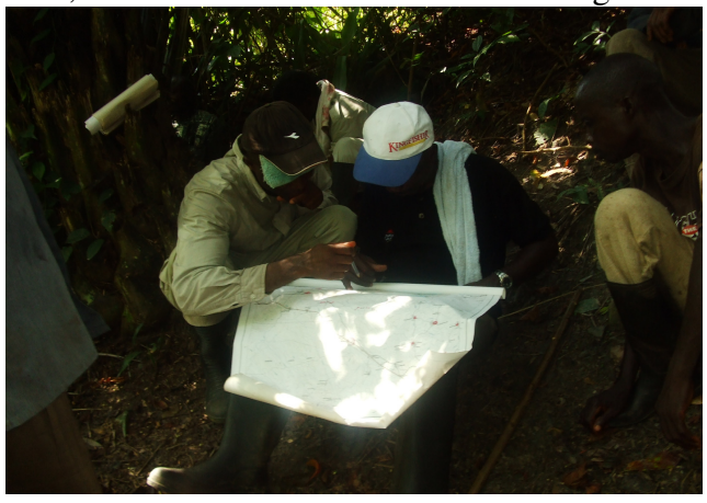
Fig.\ 2\ The\ survey\ team\ studying\ the\ topographical\ map\ for\ the\ area.

Materials such as Site layouts, photomaps and every information that were necessary for the education were obtained from relevant agencies such as the district offices and recognized bodies including the chiefs, elders and caretakers as shown in Figure 2.