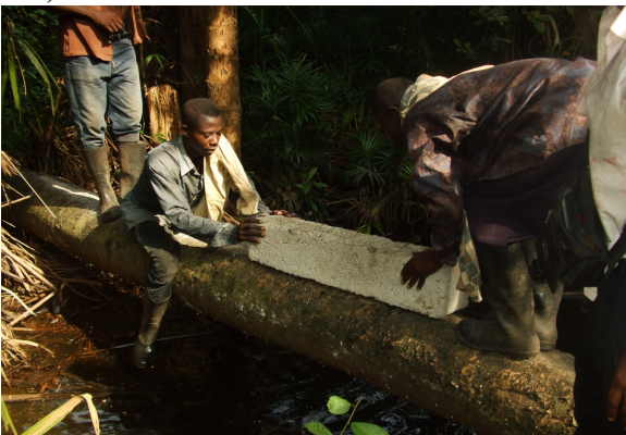
Fig. 4 Precast survey pillars that was planted along the course of the river Banko

The survey pillars (beacons) were of dimensions 22.9cm x 22.9cm x 45.7cm, of which 15.2cm was above the ground. They were used where the boundary had been defined by streams and rivers, (figure 4).