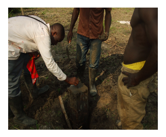
Fig.3 a) Survey Pillar planted insitu.

In the execution of the project, labourers were hired from the adjoining communities as a gesture. This was to give employment to the communities so as to get them to develop interest in the project, and also to make the knowledge of the existence of the boundary pillars known to them, (figure 3).