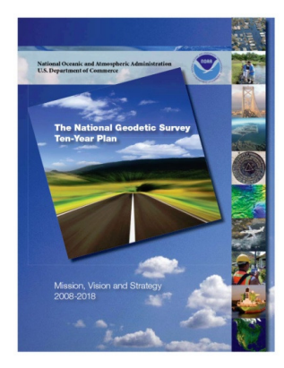
Figure 4. NGS Ten-Year Plan

In 2008 NGS leadership approved a Ten-year plan (Figure 4) (NGS 2008), in which their