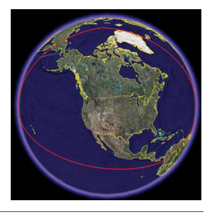
TS 10I – Vertical Reference Frame Renee Shields The Height Modernization Program in the United States and the Futur (4494)

Because of the continental scale of the project, NGS has been conducting discussions with neighbor countries, Canada, Mexico and the Caribbean nations, on possible collaborations that can support common goals. Data and expertise will be shared, just as they were when the