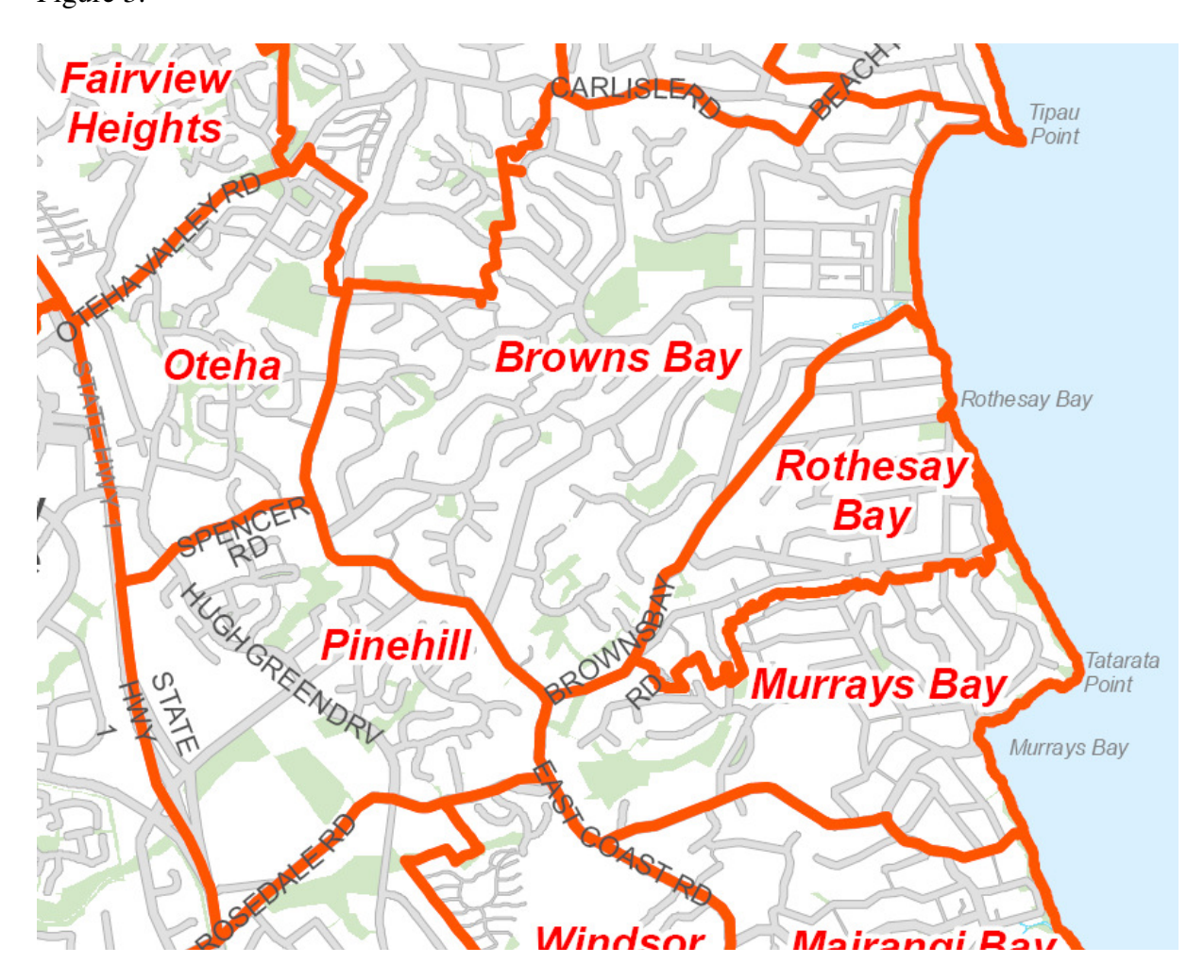
Figure 3. Example of suburb boundaries, for North Shore, New Zealand

local government definitions. Although good community consultation is required to achieve good results, even this is not always reliable due to the constant community push for a better image for certain areas. Everyone wants to live in the areas with the best name and property values! The goal in Australia has been to ensure the precise definition of all suburb boundaries, such that every property is able to be addressed with certainty – this means no gaps or overlaps between suburbs. Most often the boundaries are tied to the cadastre, although in some situations the centrelines of roads or shorelines of rivers make excellent boundaries. Urban growth often forces small changes to boundaries, and it is of great value to name and create new suburbs ahead of development and occupation. This helps avoid the constant problem faced by naming authorities, that of land developers determining future, often inappropriate, names for suburbs. An example of some suburb boundaries is given in Figure 3.