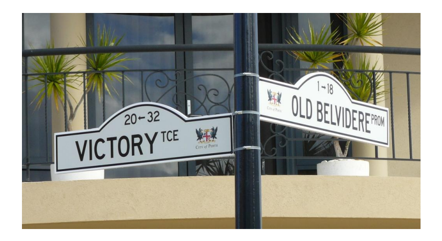
<u>Figure 5 – Example of good road signage with number ranges</u>