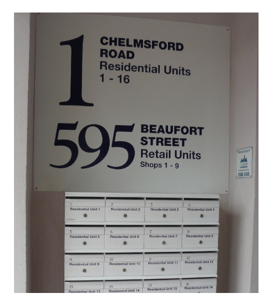
<u>Figure 4 - Example of good address</u> signage

individual address sites, including within buildings and complexes, be clearly identified with their address number.