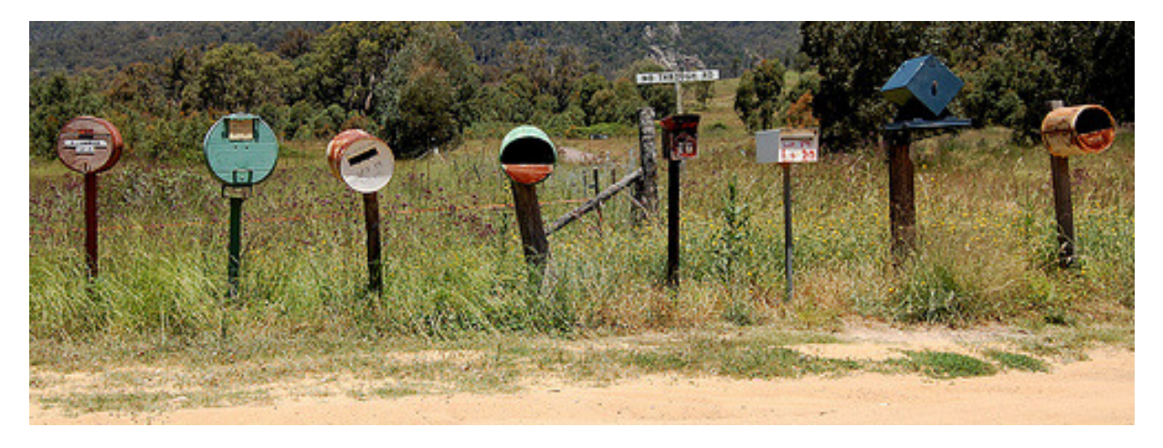
Figure 1. Un-numbered and poorly numbered rural addresses

Methods of assigning address numbers, naming roads and defining suburbs and localities slowly evolved with the development of our nations. In the last few decades however, some problems started to emerge as those systems failed to fully meet public and government requirements. This was especially evident in rural areas, where the lack of a numbering system created problems for service delivery and electoral rolls. The application of computerised mapping systems to support emergency services response has also created a demand for quality location information to enable rapid response. The public has grown increasingly intolerant of problems in responding to emergencies, including where the event cannot be correctly or quickly located.