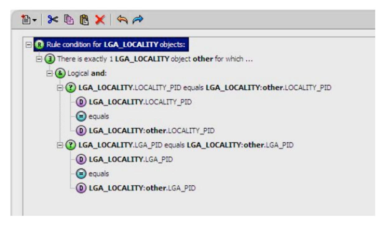
Figure 3: Rules-Definition Interface within Radius Studio

There are several key functions in the data management process when utilising Radius Studio: