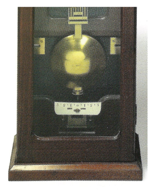
Fig.1 After Howse&Hutchinson (1969), left.