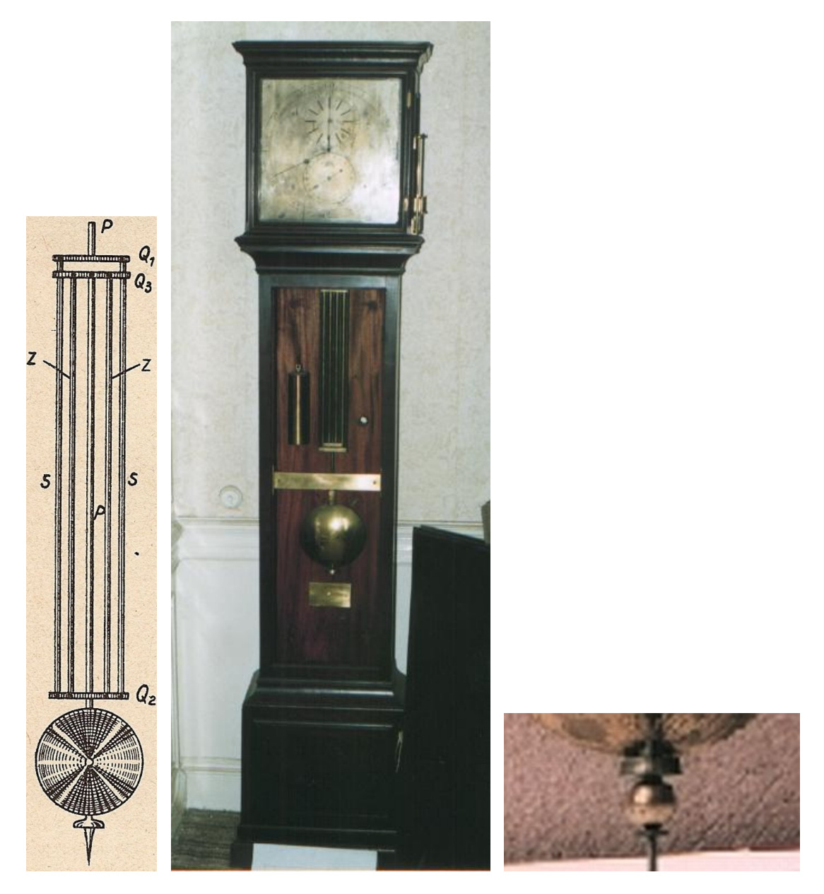
Fig. 4: Crossbar Q2 is suspended from Q1 by two steel bars (S). Crossbar Q2 moves lower when the steel bars (S) expand and lowers the pendulum bob, crossbar Q3 moves higher when the zinc bars (Z) expand and lifts the pendulum bob which is suspended from Q3. The right choice of lengths of the bars with different expansion coefficients creates temperature compensation. After Jordan & Eggert, (1948), Handbuch der Vermessungskunde (left).

Fig. 5: Sometimes the whole pendulum construction is suspended upside down as shown by the Shelton clock in the picture in the middle. After Armagh Observatory historical instruments.