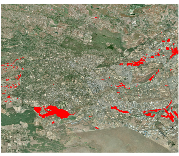
60% of Nairobi's population lives on 5% of the city's

International efforts are important to enhance the transparency and accountability in situations where the poor loose out.