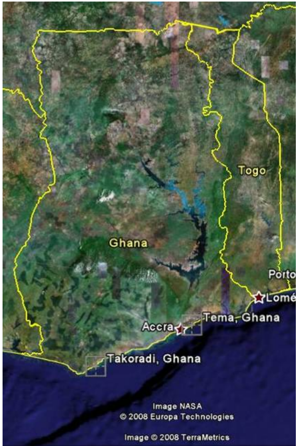
Figure 1 – Location of the existing tide-gauges in Ghana.

As mentioned, vertical variations of the tide-gauges can also be expected due to solid Earth motion phenomenon like the tectonic plate movement. In the case of Southern Ghana, where these tide-gauges have been installed, the derived seismic activity can be an important cause for sudden variations. Two major earthquakes occurred on the mainland in Accra in 1862 and 1906 and one offshore in 1939, which was after the establishment of the vertical datum using the Accra tide-gauge. The use of integrated systems (GNSS plus tide-gauges) can also contribute to monitor and quantify such movements with direct consequences in the Vertical Datum of Ghana.