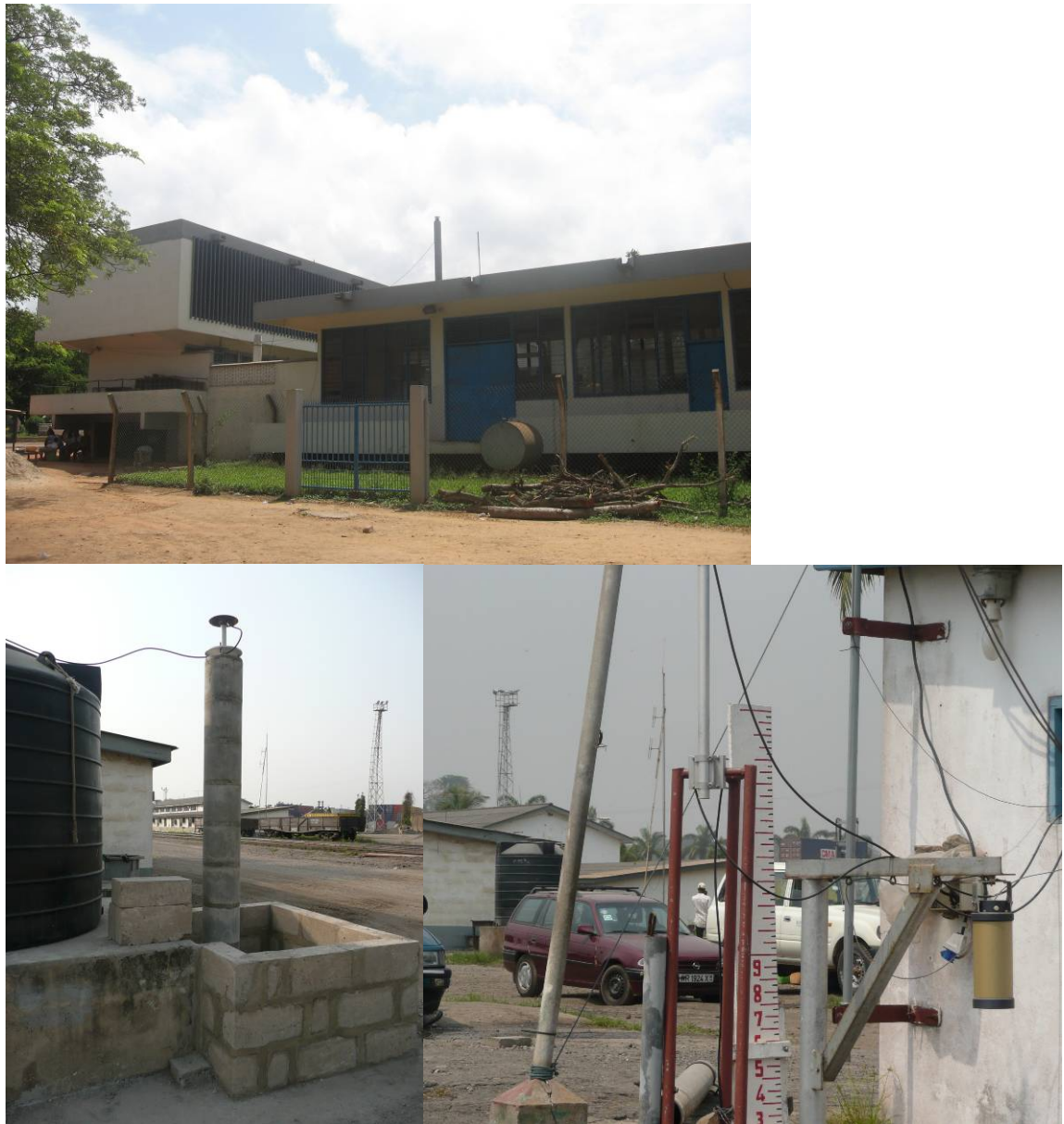
Figure 2 – Details of the installed GNSS stations in Takoradi: TADI station installed by SDG (above); TKTG station installed by CGUL/IDL-SDG-BRRI (below left) and position of TKTG with respect to the tide-gauge (below right).

submitted a project to ODINAfrica (http://www.odinafrica.org/) and UNESCO called GNSS Upgrades In Tide-gauges of Africa (GUITA) with the major goal of installing three GNSS permanent stations collocated with tide-gauges in Ghana (Takoradi) and Mozambique (Pemba and Inhambane). Such project was carried out during the second semester of 2007 and beginning of 2008.