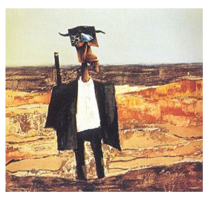
Figure 2: Portrait of Ludwig Leichhardt by Albert Tucker

Ludwig Leichhardt – Wikipedia, free encyclopaedia (http://en.wikipedia.org.wiki/Ludwig_Leichhardt)