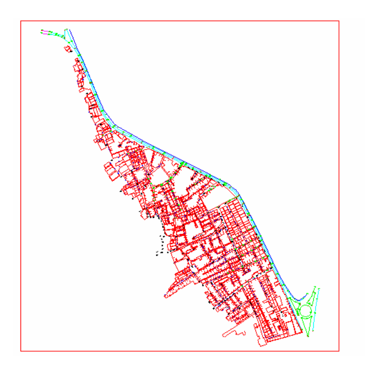
Figure (2.1) Case study area (Adam village, Ismalia Governorate, Egypt)

Such terrestrial surveying technique requires doing field works using a large number of traverse points through the irregular narrowed streets. Thus the required field surveys using such technique would be a very time consuming method. For the area shown below in figure (2.1), the area is about 100 Feddan. The main mapping activities of this area would require several days (about 5 days) to collect the data by the field crew (the crew consists of one surveyor and two prism-men). In addition, GPS control surveys required to tie the area to the national mapping system will require one-day crew (crew consists of two surveyors). The previous discussion shows that the method is a time consuming resulting into a search for another cost-effective technique to be adopted.