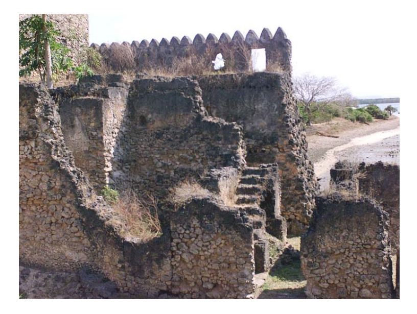
Figure 1: Broken, free standing walls inside the Gereza

As compared to wire-frames and surface models, solid models are very useful because they do not only describe the boundary of the object but its interior as well. The data structure of a solid model incorporates topology (connectivity information) documenting how vertices, edges and surfaces of the model join together. In addition material properties can be assigned to solid models thus allowing other forms of engineering analysis to be carried out. It should be noted that, although thus far documentation of historical sites has been viewed in terms of providing a basis for visualization, these added advantages will extend the value of the documentation and are essential to researchers studying historical buildings of from an engineering perspective.