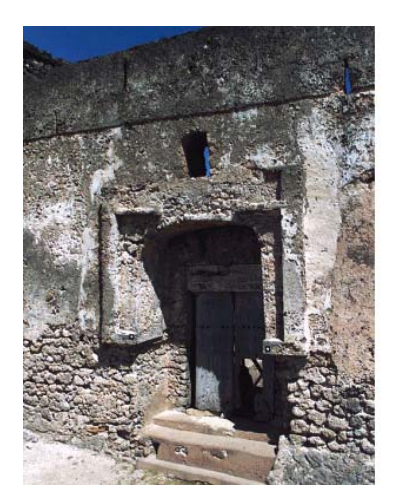
Figure 2 : Photograph (entrance gate to the Gereza's)