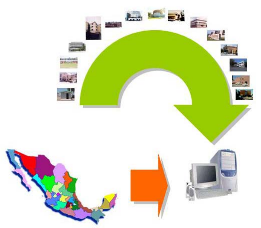
Figure 3. Scheme of deposit and consulting of RGNA's data

comments) is deposited in the central server, being located in a directory associated to the date of registry and that is available during 90 days.