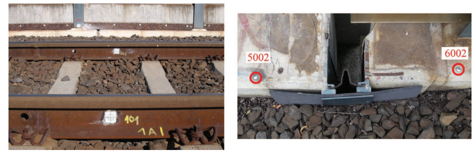
Figure 2 Stabilization of points