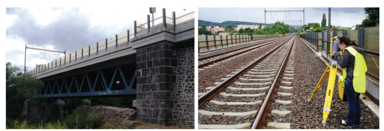
Figure 3 Railway bridge in Klášterec nad Ohří