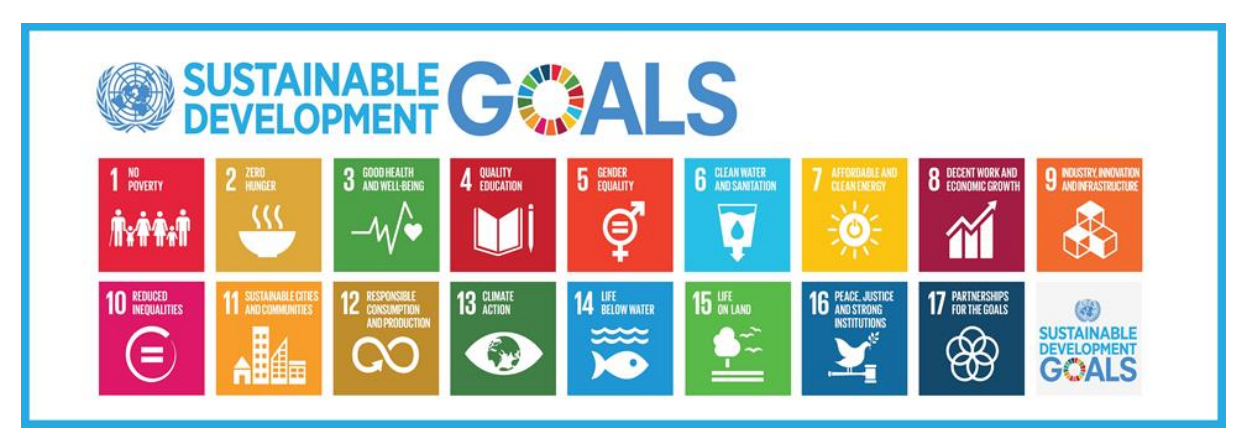
Figure 3. The Sustainable Development Goals

The SDGs, thereby, provide a framework around which governments, especially in developing countries, can develop policies and overseas aid programmes designed to alleviate poverty and improve the lives of the poor, as well as a rallying point for NGOs to hold them to account. In other words, the SDGs is a key driver for countries throughout the world – and especially developing countries – to develop adequate and accountable land policies and regulatory frameworks for meeting the goals.