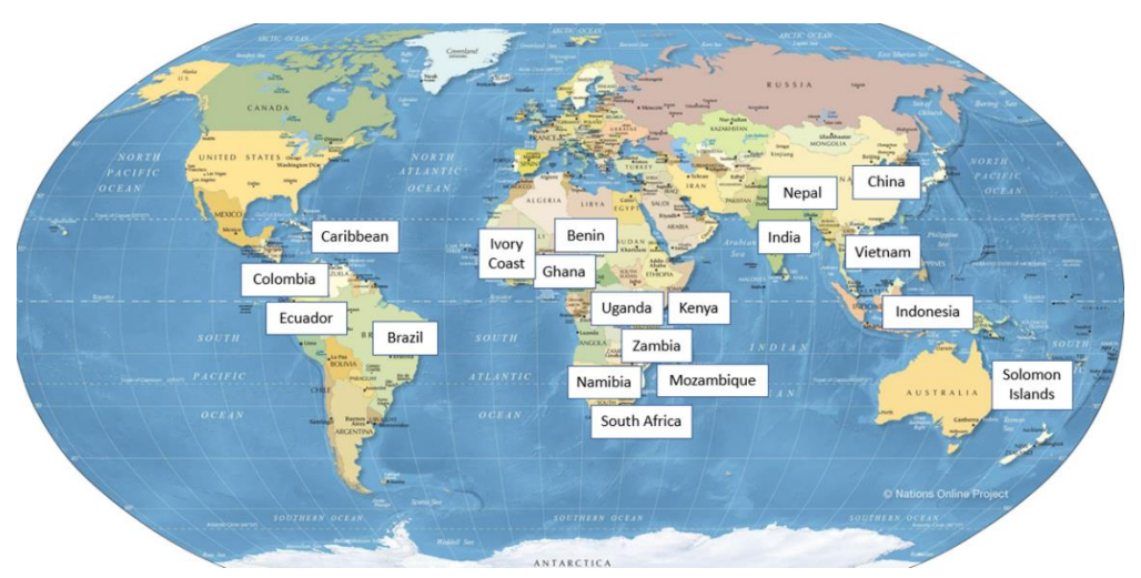
Figure 4. Applying the FFPLA approach in countries throughout the world

The phrase "Fit-For- Purpose" is widely used as a quality label for government policies or interventions. The phrase is also commonly used for any intervention or activity that is appropriate, and of a necessary standard, for its intended use. So, the label indicates that this (FFP) approach is appropriate and of a necessary standard for the purpose ... namely to provide security of tenure for all and enable control of the use of all land, rather than blindly complying with top-end technological solutions and rigid regulations for accuracy. The recent publication "FFPLA – Providing Secure land Rights at Scale" (Enemark, et al., 2021) provides an insight of the experiences and results from applying a FFPLA approach in various countries throughout the world as shown in figure 4 below.