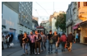
The lively Istanbul city center - a city that never sleeps