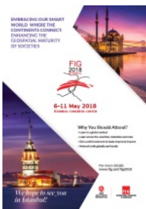
Conference ad - if you would like to use it, please contact us

Embracing our smart world where the continents connect: enhancing the geospatial maturity of societies