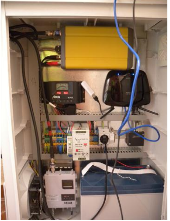
Figure 3 – Example of a system installed by SEGAL (Angola)

TS03C - Positioning and Navigation - Today and Tomorrow - 6630 Rui M.S. Fernandes, João Apolinário, Hugo Valentim, Pedro Venâncio and Nuno Gonçalves Optimizing GNSS CORS networks at remote locations (6630)