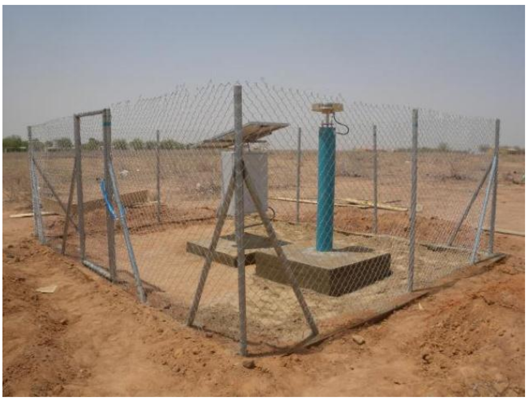
Figure 2 – Example of a system installed by SEGAL (Nigeria)