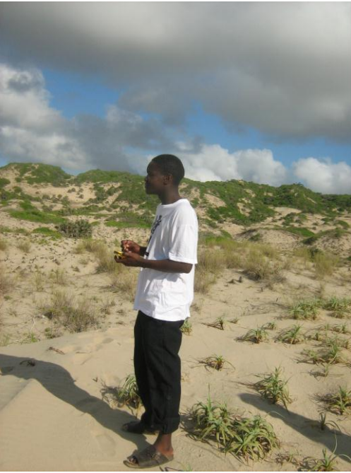
Figure 2 : A Research Assistant mapping out the sand dunes by use of the Trimble GPS. Acquafers under the dunes provide much of the water used in Lamu Town