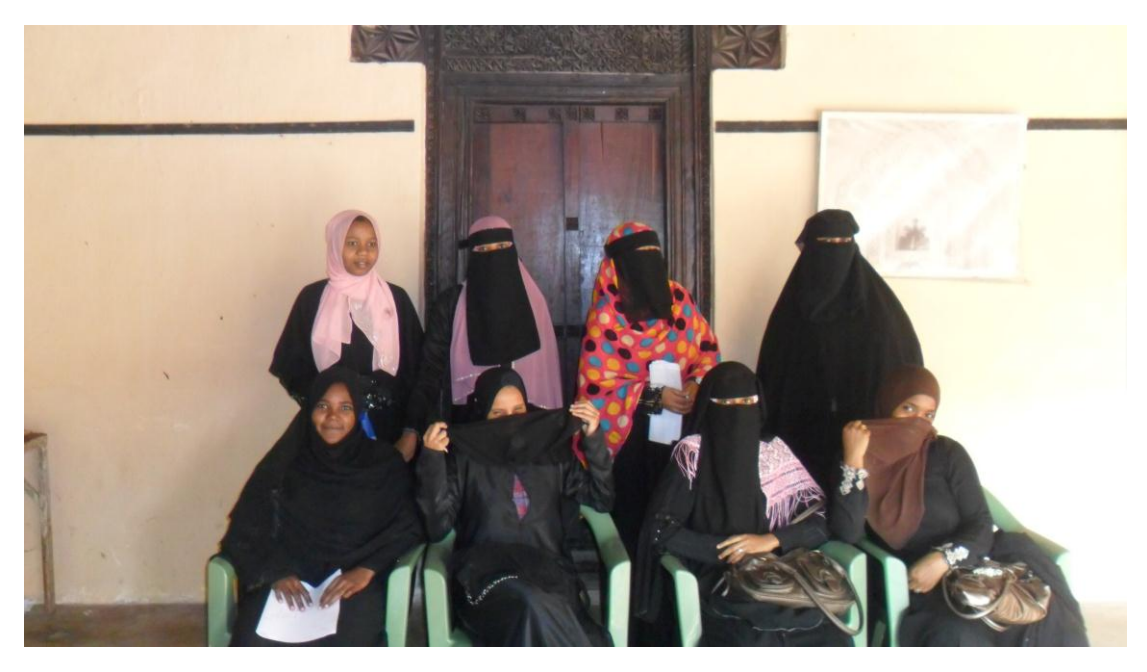
Figure 3 Female Research Assistants were key to gathering reliable information