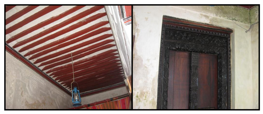
Some of the architectural features identified during the household survey