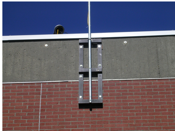
Figure 1. A flush building mount