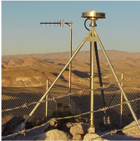
Figure 2. A deep-drilled braced ground mount

- a pillar mount is recommended to be 2 to 2.5 m in height and poured to a depth of 4m. Conduits within the concrete pillar may produce cracks in the pillar over time (see Figure 3).