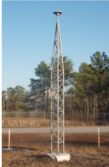
Figure 4. A tower mount

- A tower mount can be used when obstructions or other considerations require elevating the mount beyond the typical pillar construction heights. The foundation is poured to the same depth as pillar mounts. Guy wires may be needed to stabilize the tower (see Figure 4).