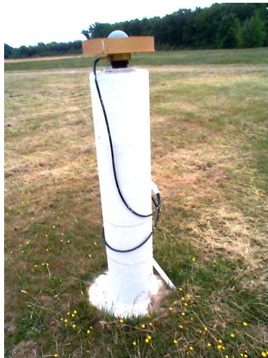
Figure 3. A pillar mount

- a pillar mount is recommended to be 2 to 2.5 m in height and poured to a depth of 4m. Conduits within the concrete pillar may produce cracks in the pillar over time (see Figure 3).