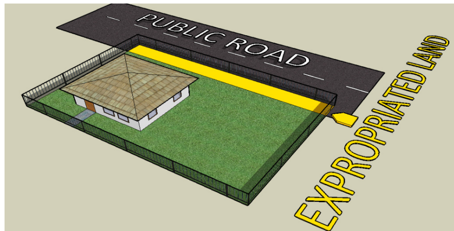
Fig.2. Visualisation of a partial property expropriation example for widening a road - Scenario 1