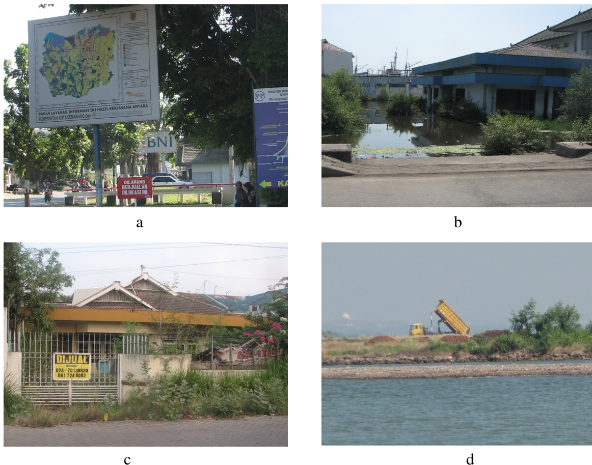
Figure 3. A billboard with spatial plan map placed in various locations in the city (a), abandoned office because of continuous inundation from sea water as a result of land subsidence (b), a house in the formerly elite location is to be sold because of frequent flooding and inundation (c), land reclamation in importantly sensitive environment of mangrove forest (d). All photos were taken in July 2009.

Pressure from population growth and limited available space has forced people to use marginal land on the hill slope and river bank for housing purpose. The risks of natural hazards are severe and need to be addressed appropriately. Figure 3 shows snapshots from the study area on the aspect of spatial plan, impact of disaster and current development activities.