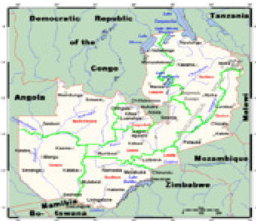
Figure 1: Zambia

Some extreme weather event have changed in frequency and/or intensity over 50years. It is likely cold nights , cold days and frost before less frequent over most land areas, while hot days and hot nights have become more frequent. It is likely the frequency of heavy precipitation of rainfall will be more. Reduced yield in warmer regions due to heat stress and increased danger of wildfire. This will to increased demand water.