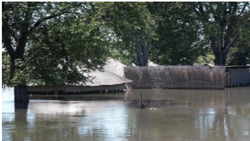
Figure: Zambia and floods

Further more, accelerated economic and infrastructural development will probably increase the risks of climate change in Zambia. Clearing forests for construction and increased industrializing will have negative consequences on Zambia's environment and atmosphere. Climate risks are definitely a challenge to development in Zambia. They are impacting negatively on our development. Zambia needs to mainstream climate risk reduction in its developmental process because the more developed you become, the more vulnerable you get.