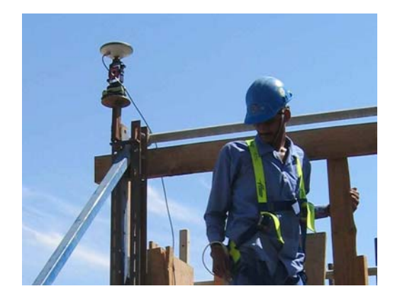
Figure 1: GPS and circular prism collocated

In static GPS mode, satellite signal data is received and recorded for a period of up to 1 hour. During this same period of time, the TPS instrument is used to measure a series of angles and distances to the prisms mounted below the GPS antennas. The TPS then measures to the reference marks placed on fresh concrete which are the reference points for control of the formwork as described in 1.4.1.