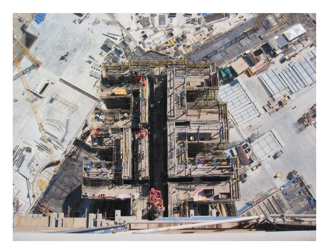
Figure 3: GPS active control points

To remove that restriction it will be necessary to consider this instrument as a local 3D axis system. The coordinates computed by using the observations (directions and distance) are internally consistent but must be transformed into the reference frame defined by the set of GPS antennas. In our case as we use a single total station, the problem is simply a 3D transformation also known as similarity transformation or Helmert transformation.