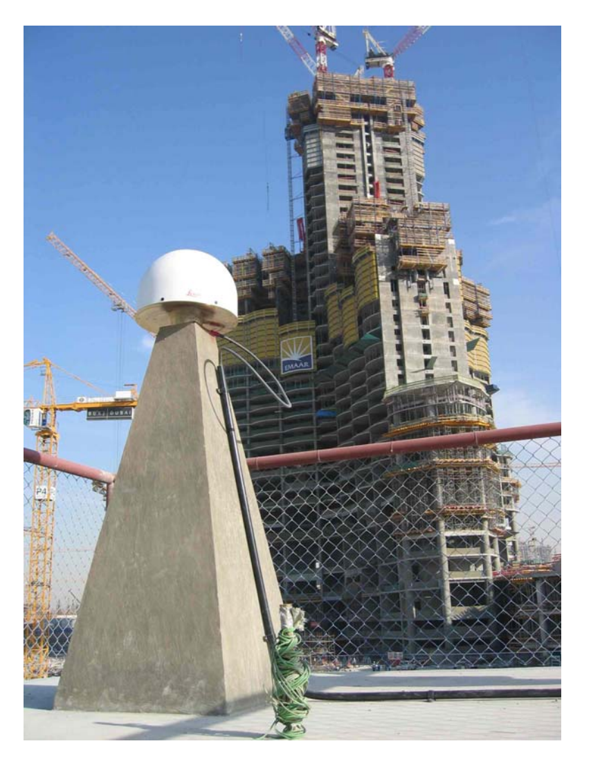
Figure 2: Continuous Operating Reference Station

Computation of TPS position is then carried out actually as a least squares resection. Finally transformation is performed of the 3 no WGS84 antenna coordinates and resected TPS coordinates into the local coordinate system and from this a determination of coordinates of all measured reference marks is made. These steps yield coordinates of survey instrumentation and reference marks in the site project coordinates.